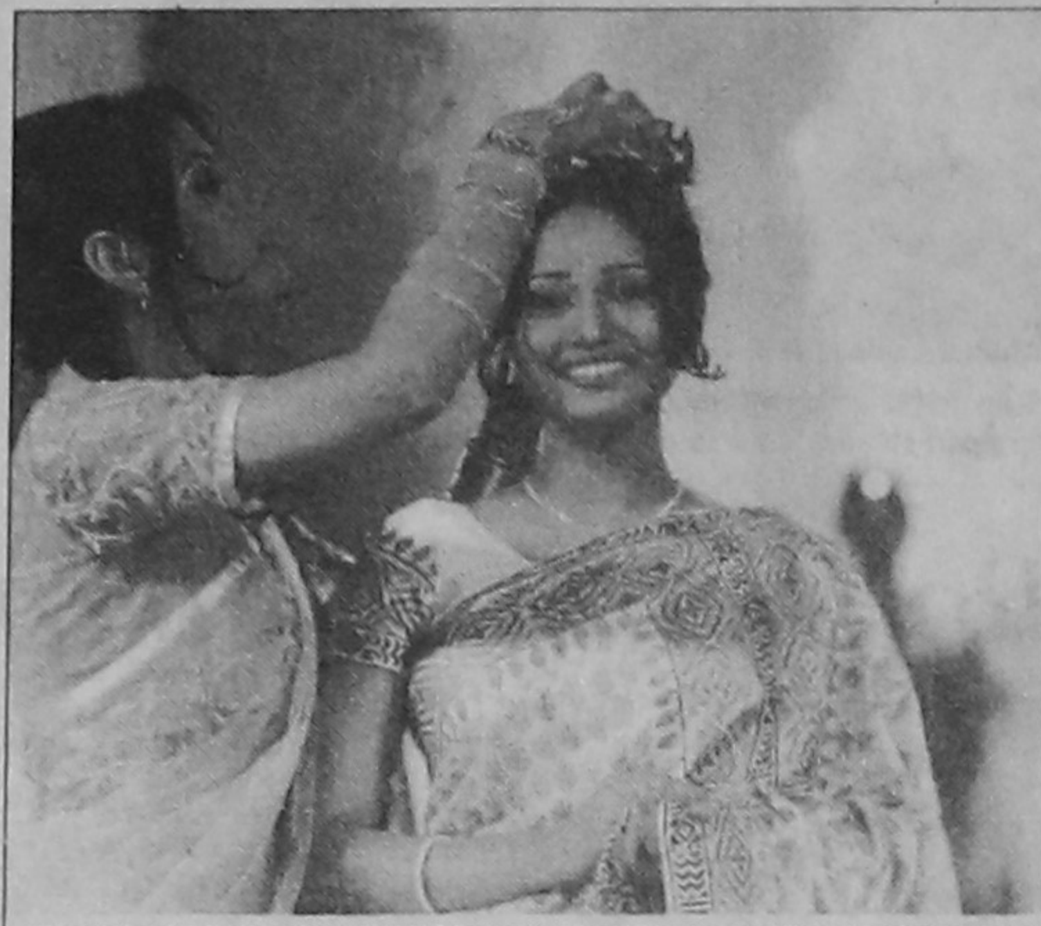
Crowning of a new Lux star

The finalists of this year's contest were shortlisted from among three thousand hopefuls who sent in their applications from all over the country. After preliminary scrutiny, this number was narrowed down to a 100 after which a second round of selec-