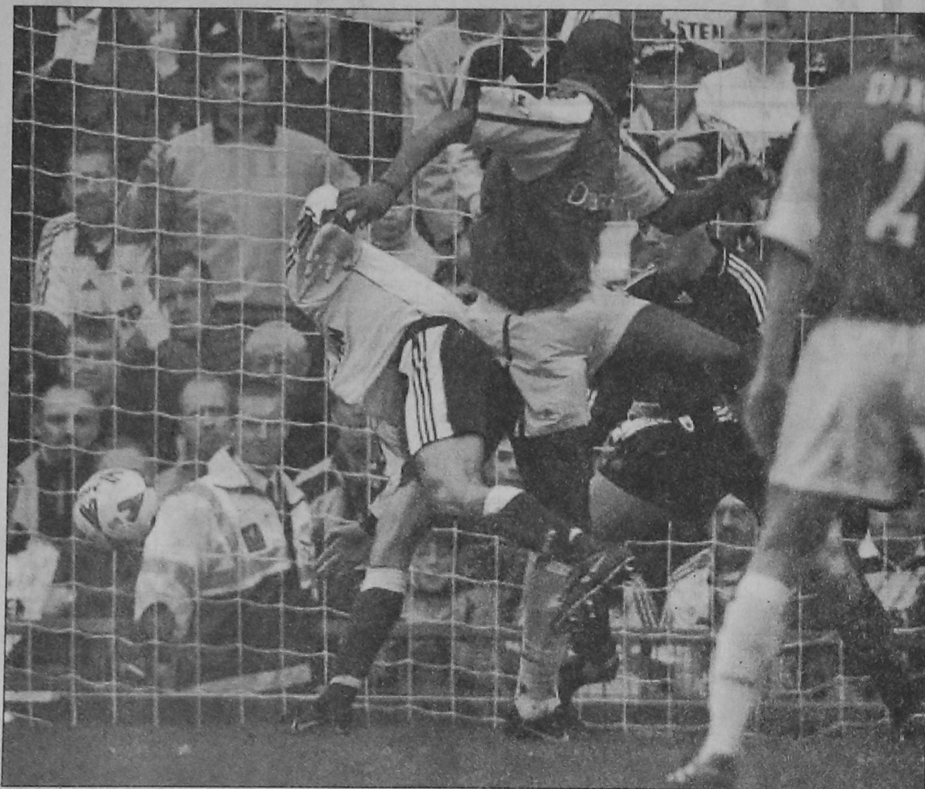
Arsenal's French international mid-fielder Patrick Vieira (C) heading in his team's first goal against Tottenham Hotspurs in the first semi-final of the FA Cup at Old Trafford on Sunday.