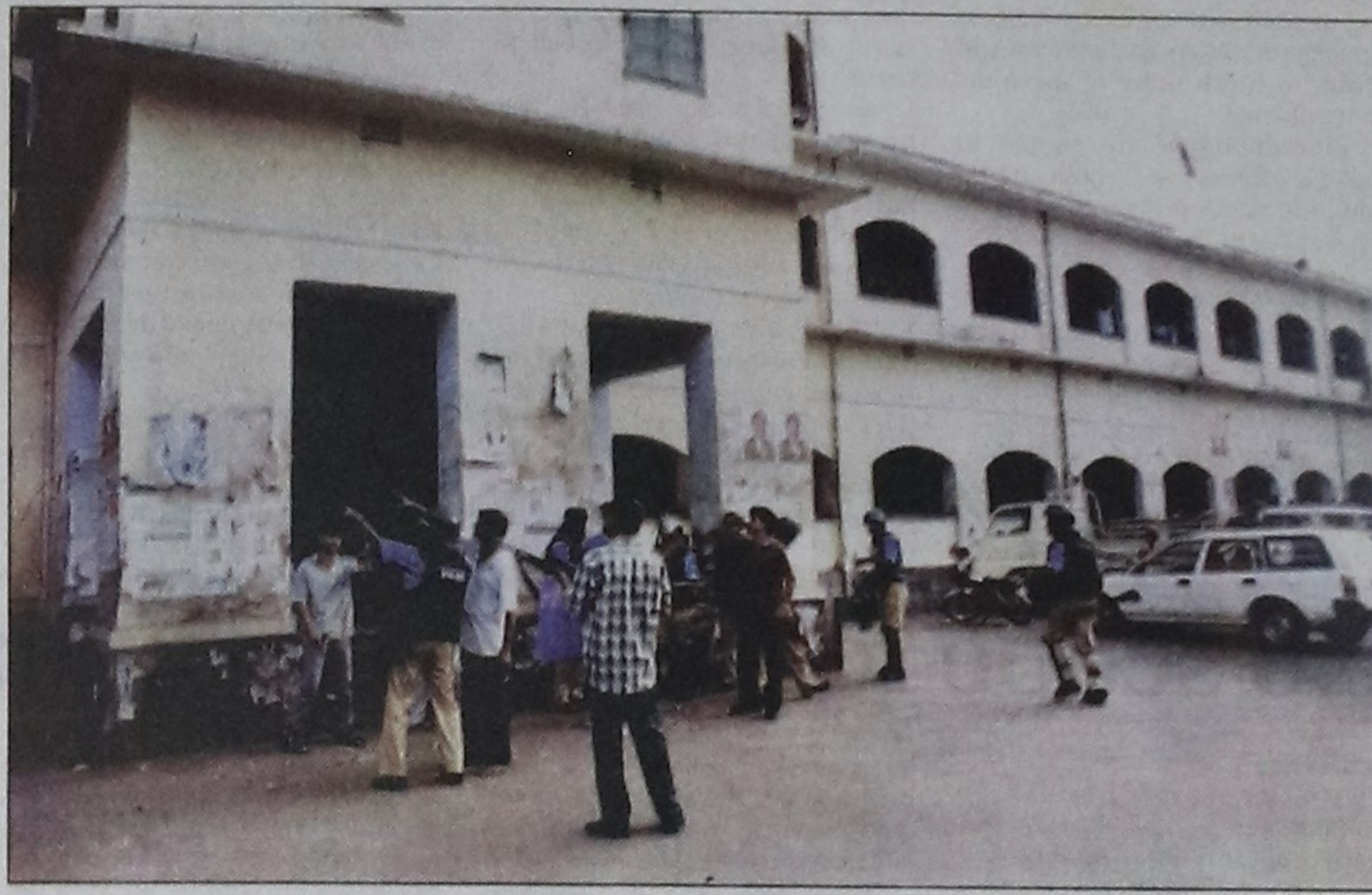
Policemen take position after bombs were hurled at the vehicle carrying alleged terrorist Tokai Sagar on the eastern side of the DC office on Johnson Road in the city yesterday, leaving eight people injured.

The meeting sources said the SIAs would not attend any meeting convened by the NPD and the MoEF until their demands are realised.