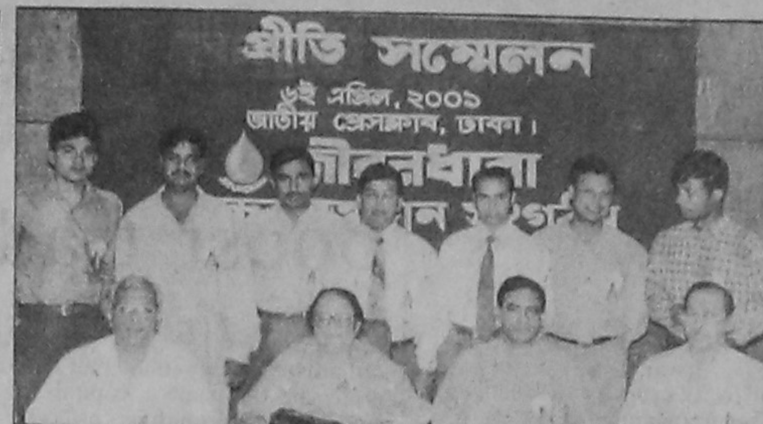
Jibondhara, a voluntary organisation, was launched at a ceremony at the National Press Club on Friday. The objective of the organisation is to provide blood for the patients in critical condition.

He also hoped that both the government and the opposition parties would pacify the present situation through mutual understanding, tolerance and respect.