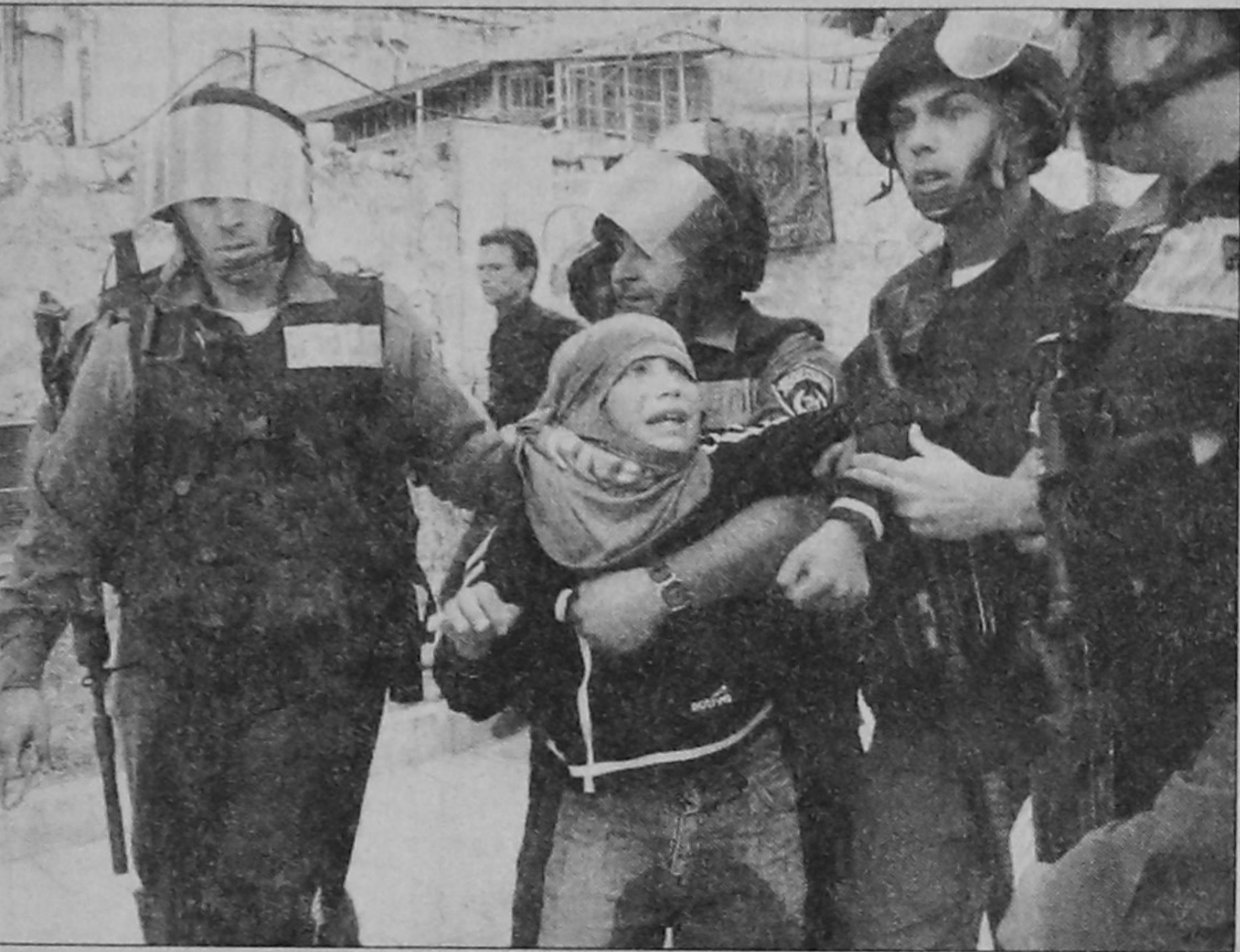
Israeli border police arrest a Palestinian boy during clashes after Juma prayers on Friday in the Old City of Jerusalem. Three Palestinians were rushed to hospital with bullet wounds during a confrontation in the West Bank town of Bethlehem in which Israeli troops fired tear gas and rubber bullets at a crowd of around 70 stone-throwers protesting Israeli "assassinations" of Palestinians.

The quake centered at 4.86 degrees southern latitude and 100.89 degrees eastern longitude.