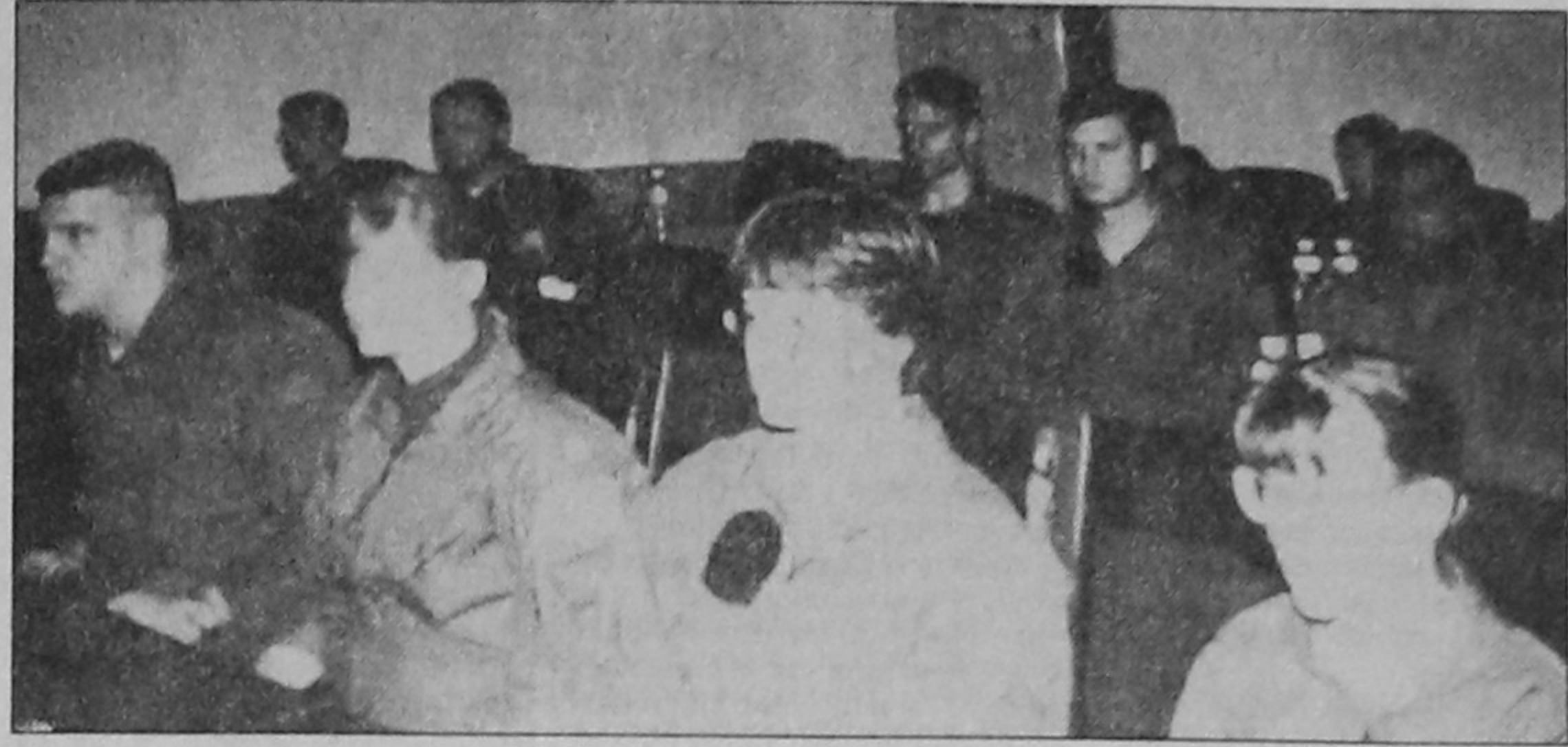
This undated photo released by CBS News reportedly shows some crewmembers of the US plane detained in southern China.

Sealock said after the second visit the first without a Chinese official present.