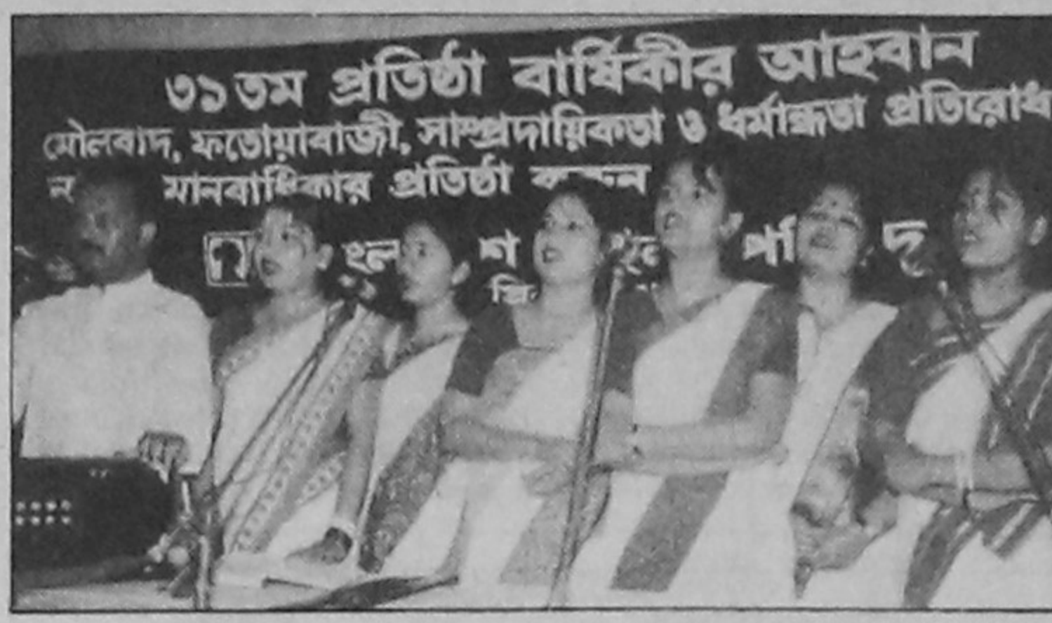
Artists presenting a chorus number at a cultural programme organised at the National Press Club yesterday to mark the 31 st founding anniversary of Bangladesh Mohila Parishad.

Candidates must bring all original certificates, marks certificates and the duplicate admit card of the admission test at the time of the interview, the release added.