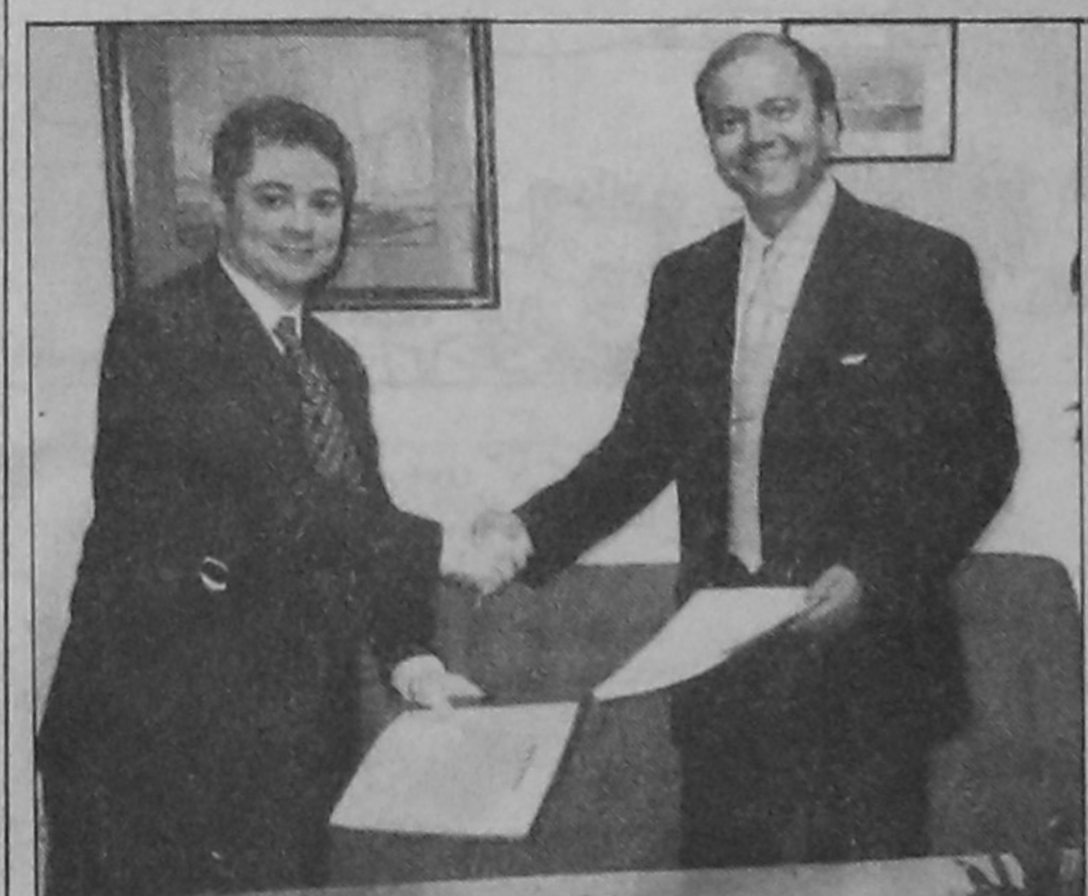
Picture shows the officials of Transworld and Nera Satcom, Norway, exchanging the documents of a signed distribution agreement in Oslo recently.

Bangladesh army working with UN peacekeeping forces are already using Inmarsat Mini-M Satellite Telephones. Bangladesh Air Force is also using the same set for different operations, it added.