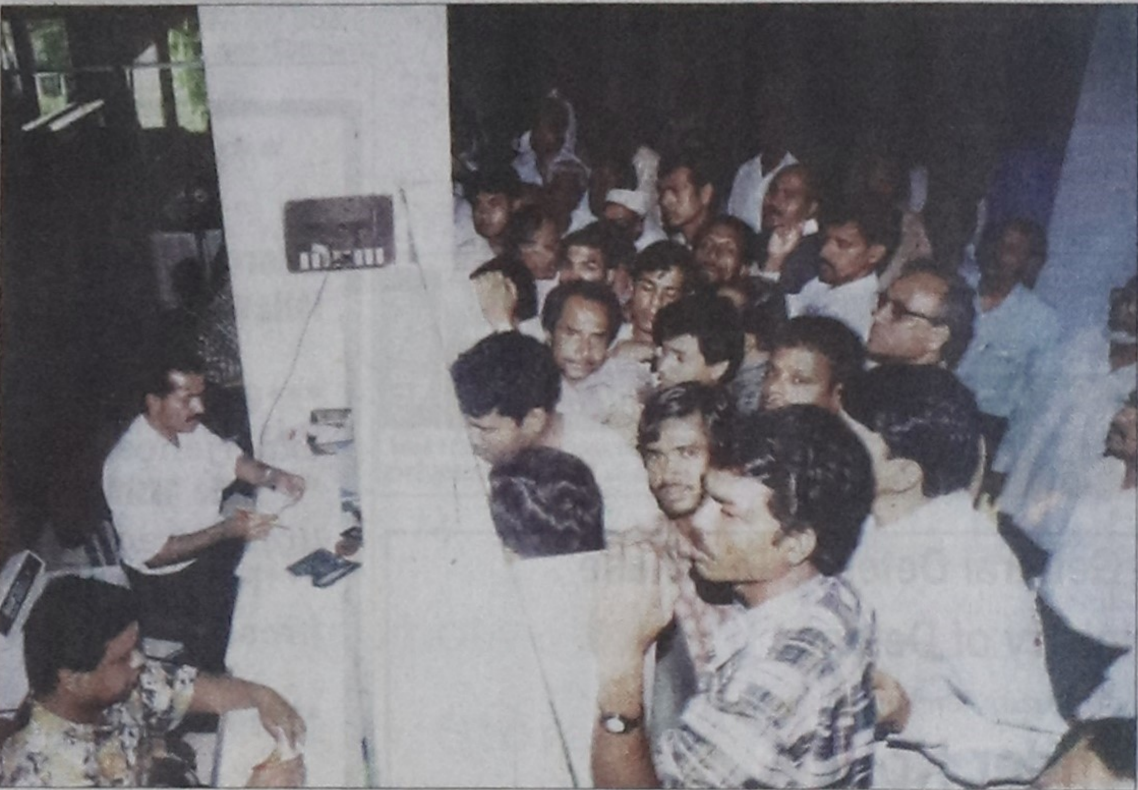
Telling trouble... tellers at a city bank work at a frenzied pace as they attend a swelling crowd of customers, forced into a transaction overdrive yesterday following 60 hours of non-stop hartal called by the opposition alliance.