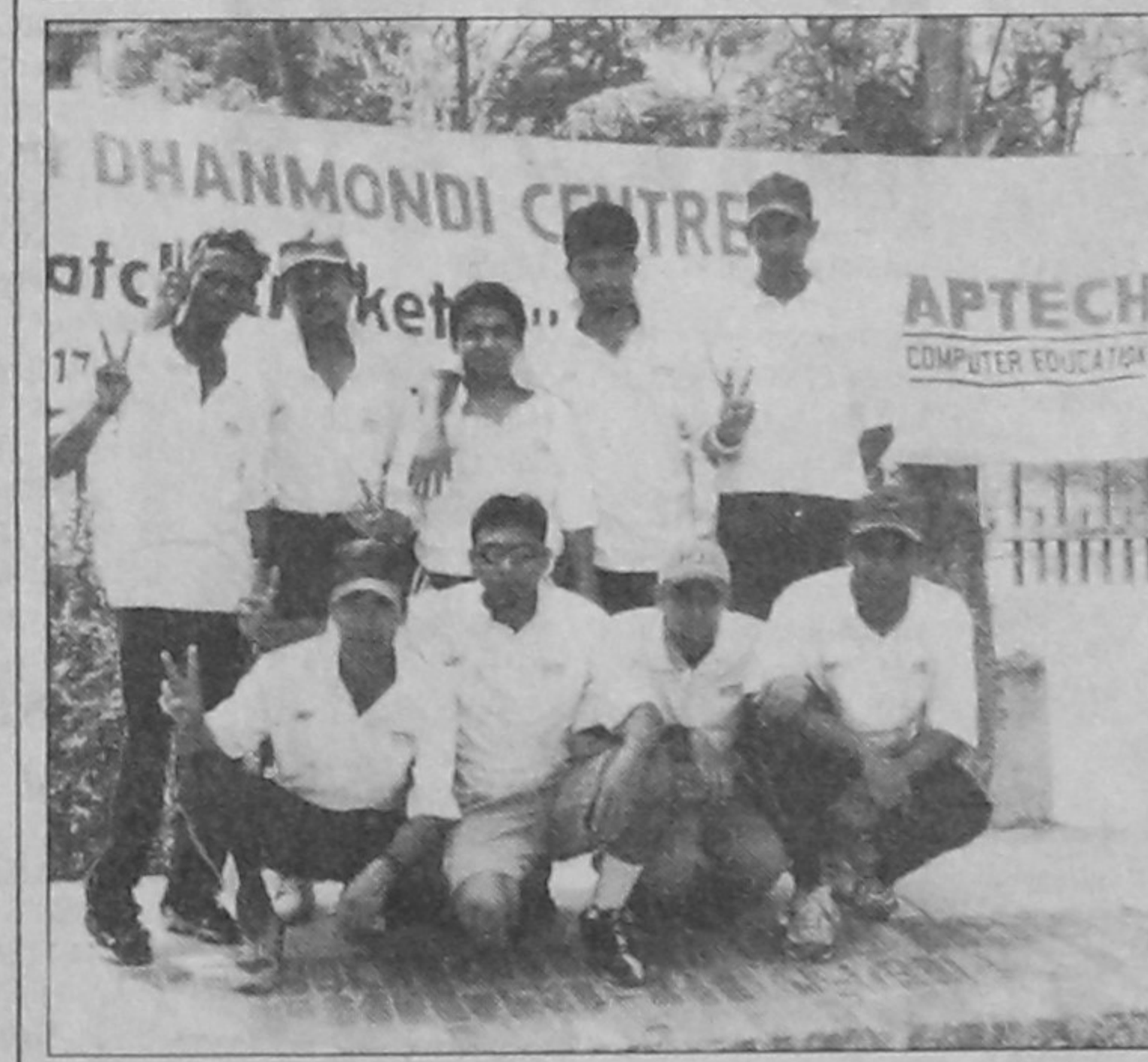
Members of the Windows team which became champions beating Linux in the Apteck Dhanmondi inter-batch cricket tournament at the Kalabagan Cricket ground on March 29.

Rafter reached his first Masters Series semifinal since 1999 in Cincinnati. He last reached an ATP final last October in Lyon.