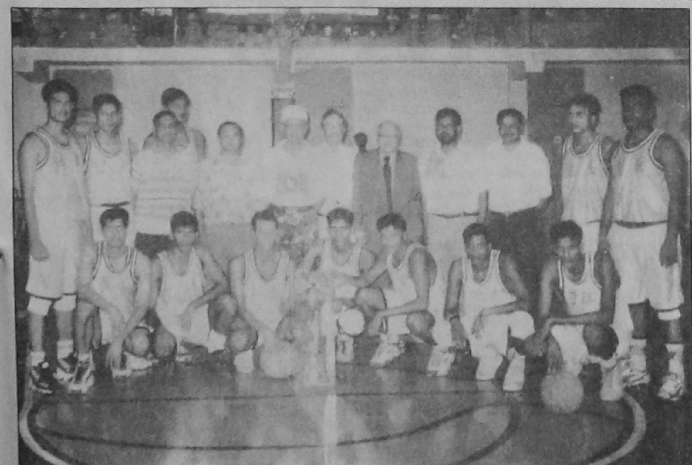
Players and officials of Bangladesh Navy who clinched the BGIC Independence Cup basketball tournament title at the Dhanmondi gymnasium on Saturday.

Popular cine artiste Madhuri Dixit and classical dancer Sonal Mansingh were also sighted among the luminaries.