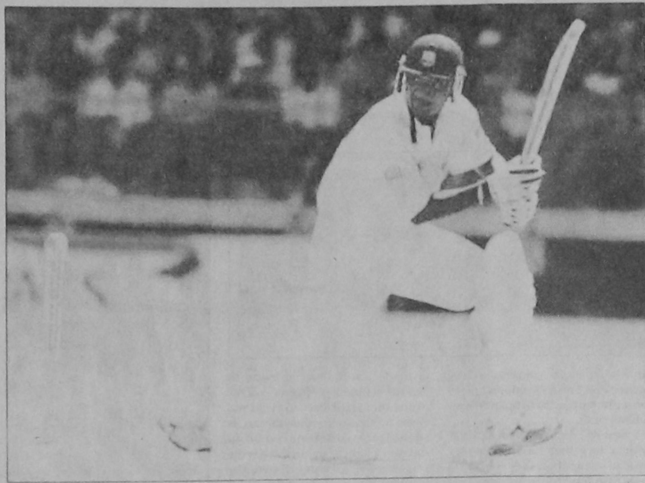
West Indies captain Carl Hooper plays one square of the wicket during the third day of the third Test against South Africa on Saturday.

The South Africans have a chance to atone for their poor effort when they clash with Indian side Mumbai Sunday on the fourth day of the competition.