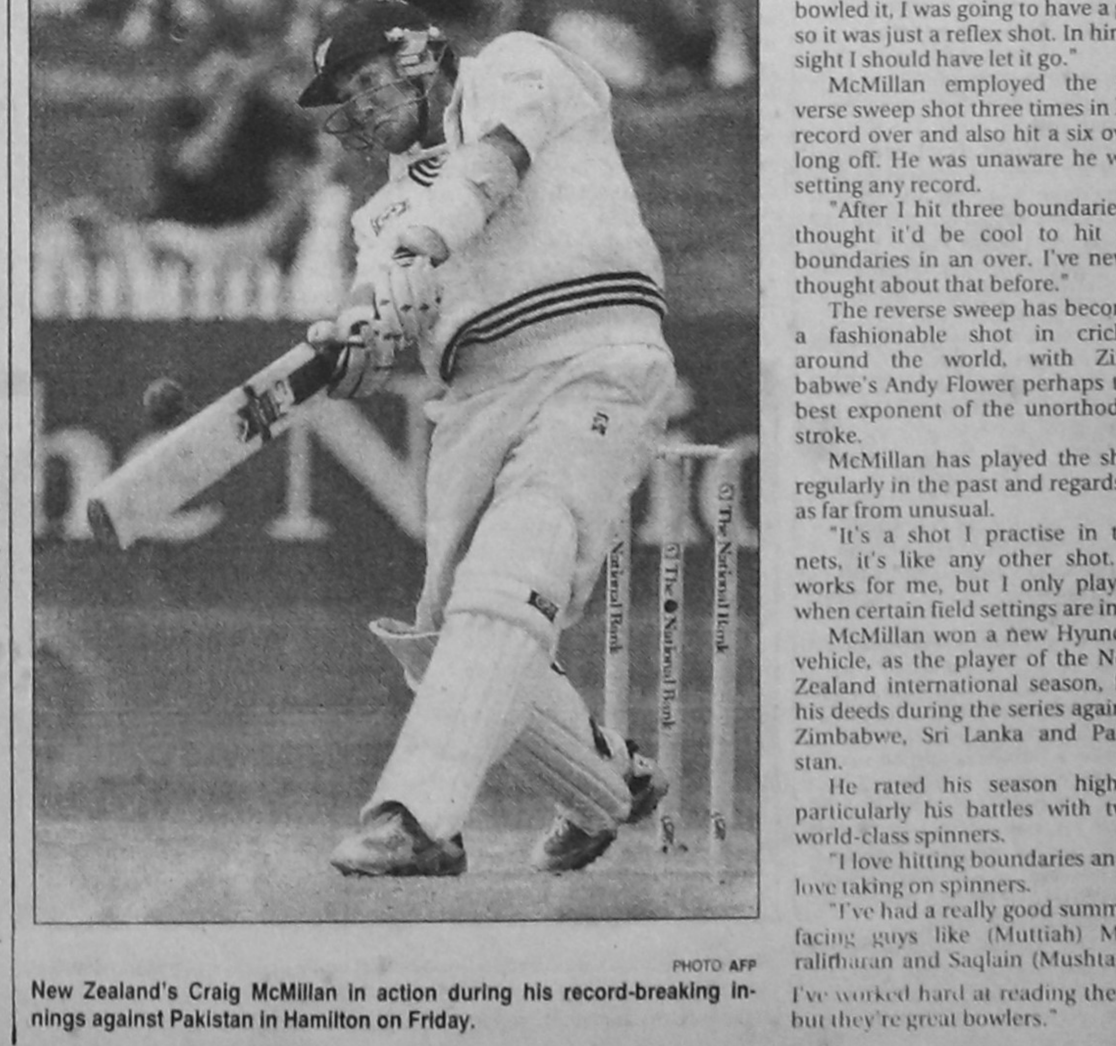
New Zealand's Craig McMillan in action during his record-breaking innings against Pakistan in Hamilton on Friday.