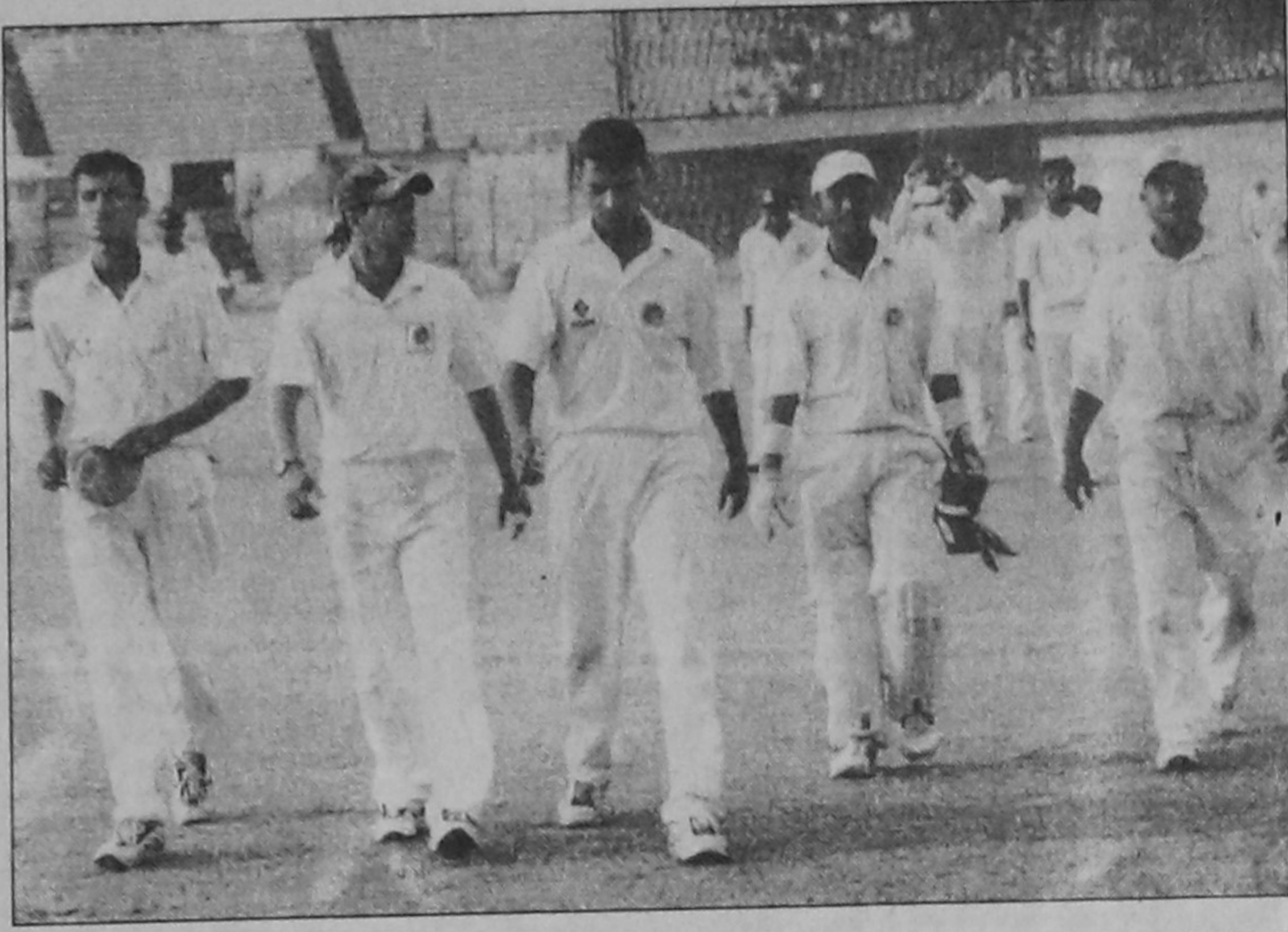
Mohammedan players leaving the field after their victory over Kalabagan Krira Chakra in the Premier Division Cricket League at the Bangabandhu National Stadium on Friday.

(England cricketer) "Sri Lanka were more skilful than us in the one-day game. It is really in the batting that we failed and that is something that we will have to look at hard." After England's 10-wicket defeat to Sri Lanka in the third one-day.