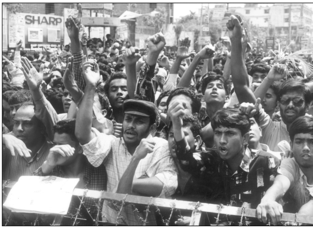
Police intercepted a procession of the All Party Students Unity (APSU) at Dhanmondi Road no 27 yesterday. APSU activists were on their way to lay siege to the Jatiya Sangsad Bhaban to press home their demand for resignation of the government.

don't even not know that Aedes Aegypti breed in such containers. A total of 9,462 houses, with average of 100 houses per ward, were investigated to observe and record larvae breeding. A total of 40,704 wet containers were collected and checked in laboratory. The results indicate that a high Aedes density pose a serious threat to public health and more resources should be allocated to areas with high density of Aedes mosquito. According to another study also presented at the workshop, out of 3000 species of mosquitoes in the world, 113 types exist in Bangladesh. All four types of vector, sources of deadly diseases like filaria, malaria, dengue and dengue haemorrhagic fever and Japanese Encephalitis exist in Dhaka city. The study also showed that unplanned urbanisation, blocked surface drains, unplanned filling of low lands, embankment around the city cemented tanks are some of the factor affecting mosquito prevalence in the city.