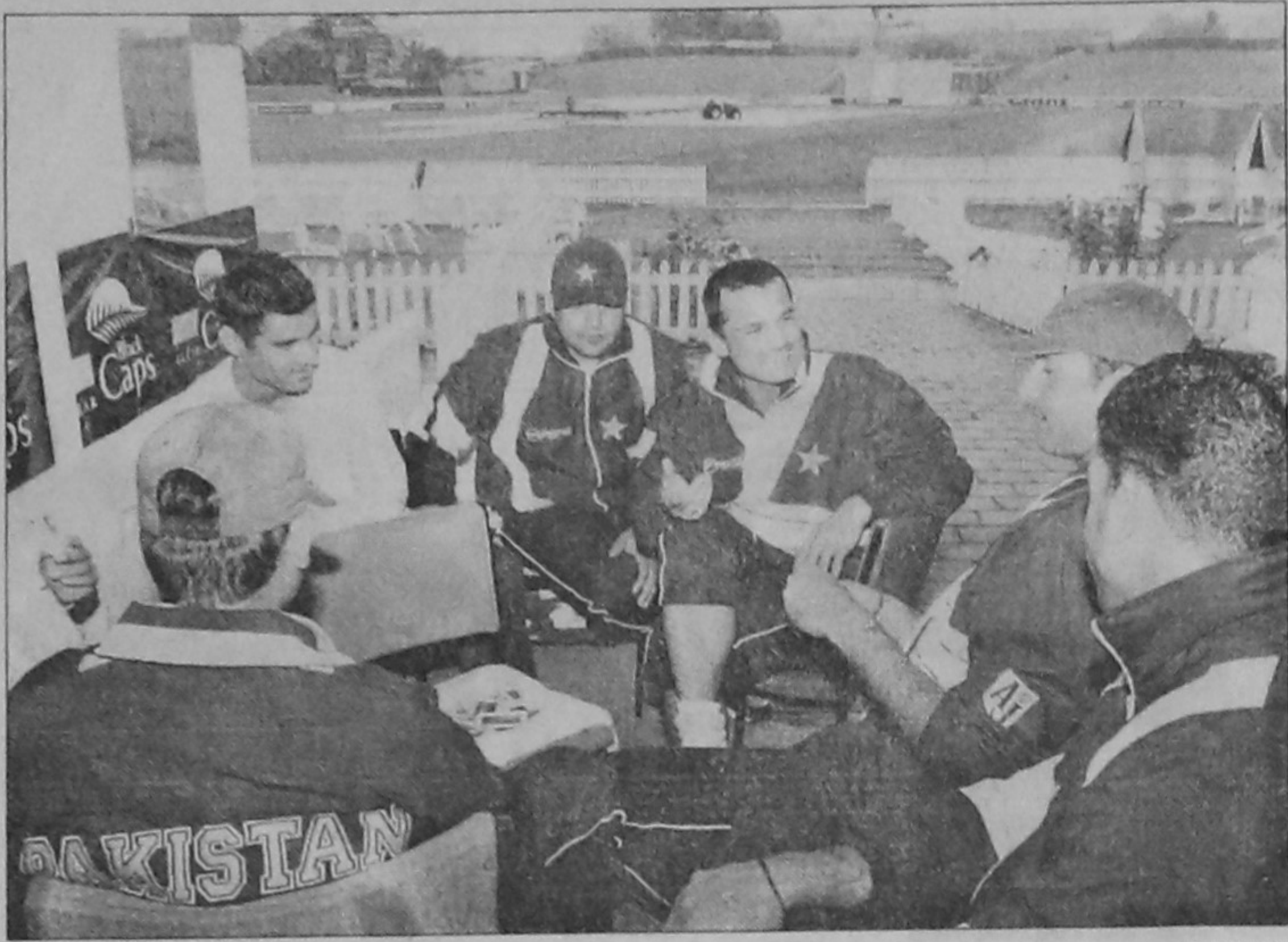
Members of the Pakistan cricket team passing their time playing cards after rain washed out the second day's play of the third Test against New Zealand at Hamilton on Wednesday.