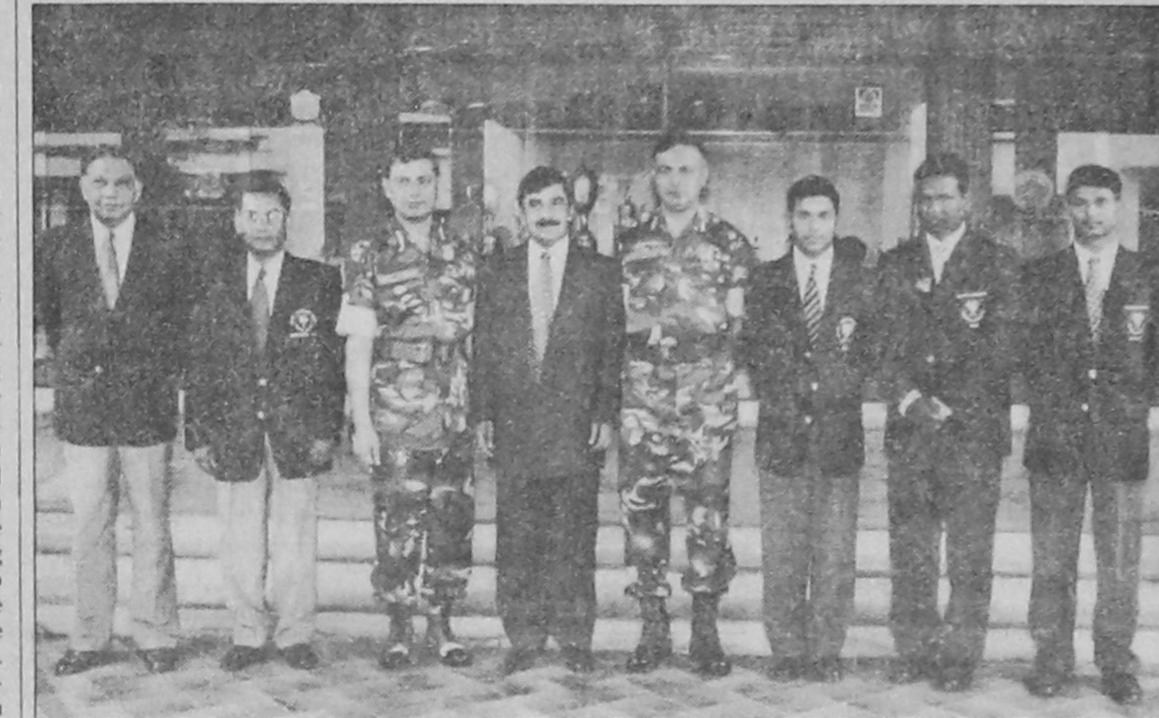
Chief of Army Staff and president of Kurmitola Golf Club Lt Gen M Harun-Ar-Rashid (4th from R) is seen with the Bangladesh golf team that left for Sri Lanka on Wednesday to take part in the 11th Dulux Open Amateur Championship which will be held in Kandy from March 31 to April 7.

They will first play in a four-day 72-hole match-play competition and later take on national teams from India, Pakistan and Sri Lanka over one round.