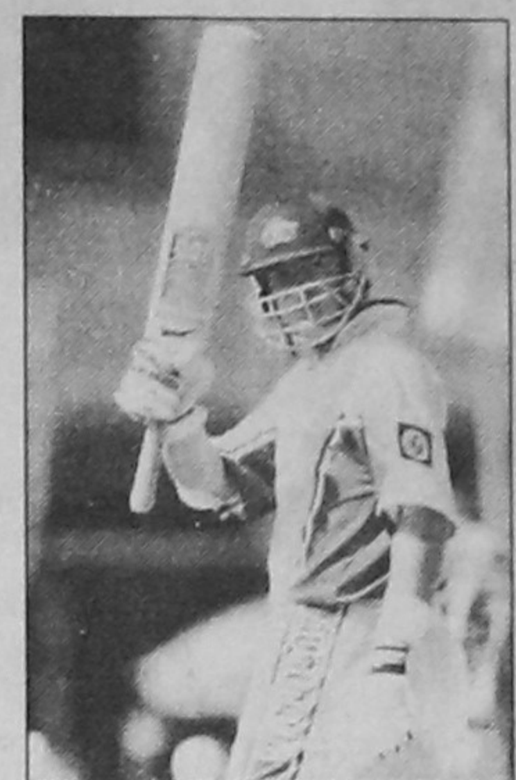
M WAUGH ... m-o-m

After Hayden and Lehmann were removed within the space of