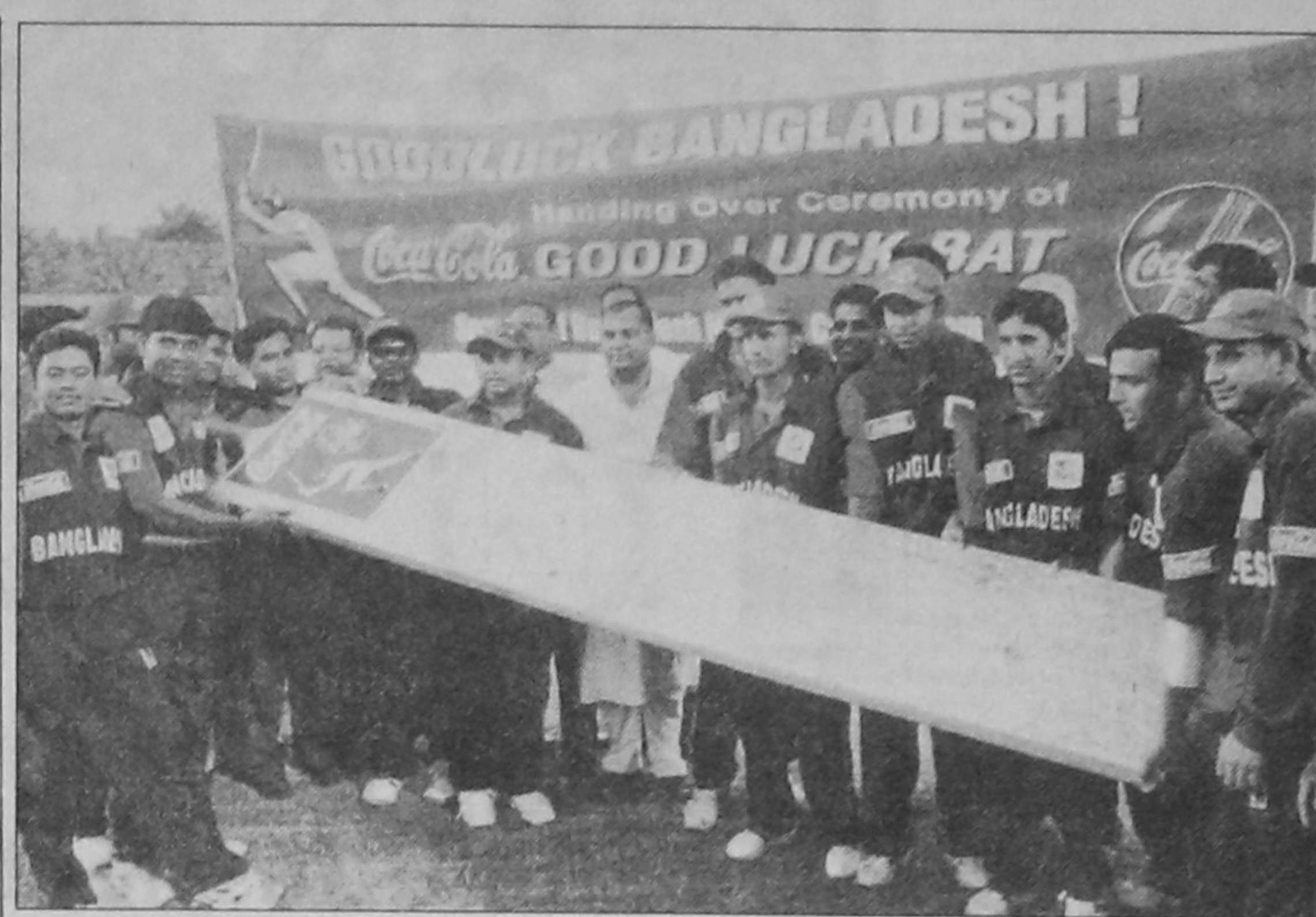
The giant 'Good Luck Bat', sponsored by Coca-Cola Far East Limited, was handed over to the national cricket team on Tuesday. The bat, containing signatures of thousands of cricket fans, will accompany the team on its tour of Zimbabwe. Bangladesh go on their maiden overseas Test tour on April 1.

Several other footballers from past and present, including Bebeto, Renato Gaúcho, Zico, Juninho, Lairzinho and Branco will take part in the match.