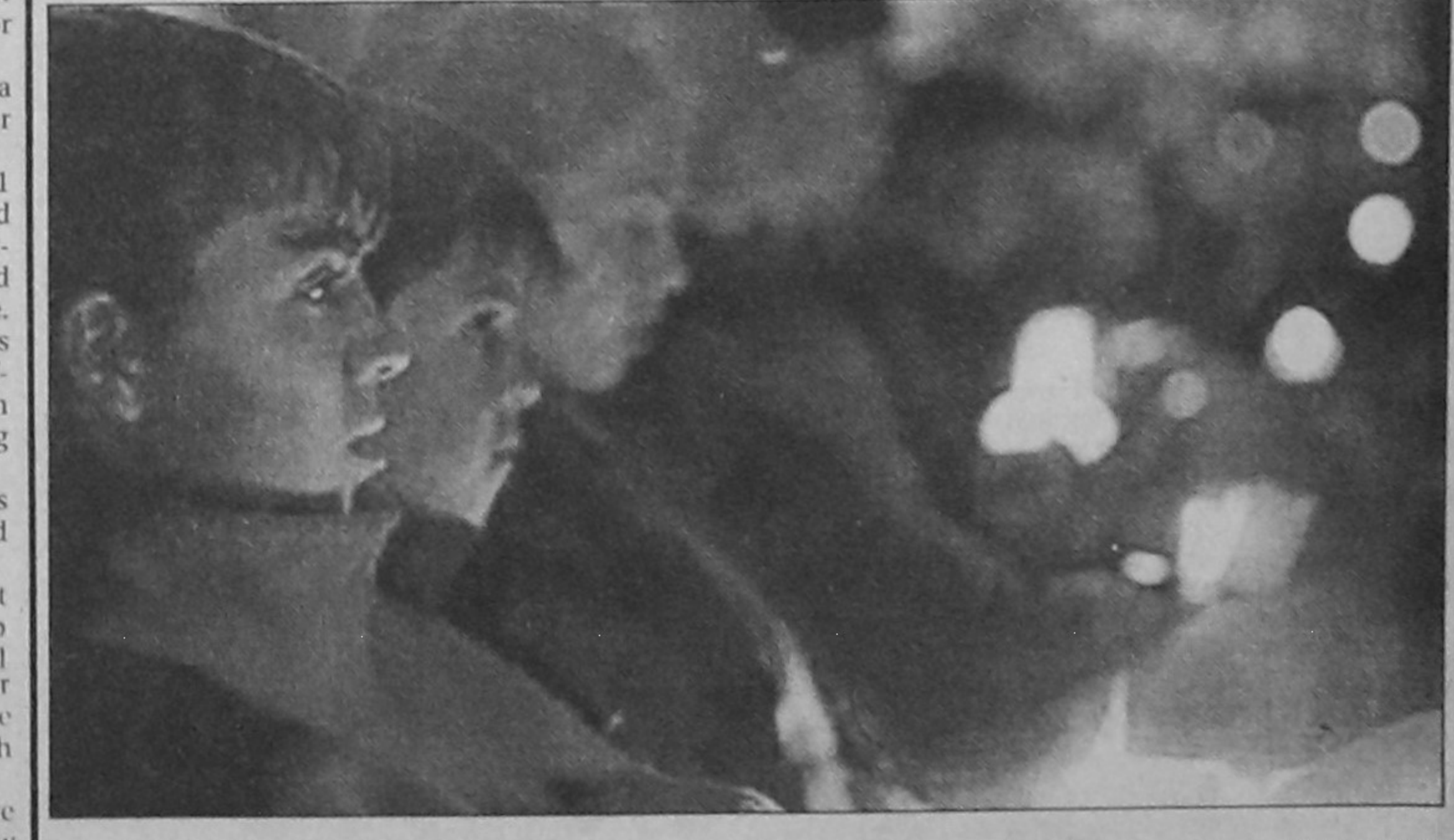
Fans at the Adelaide Oval watch the service.