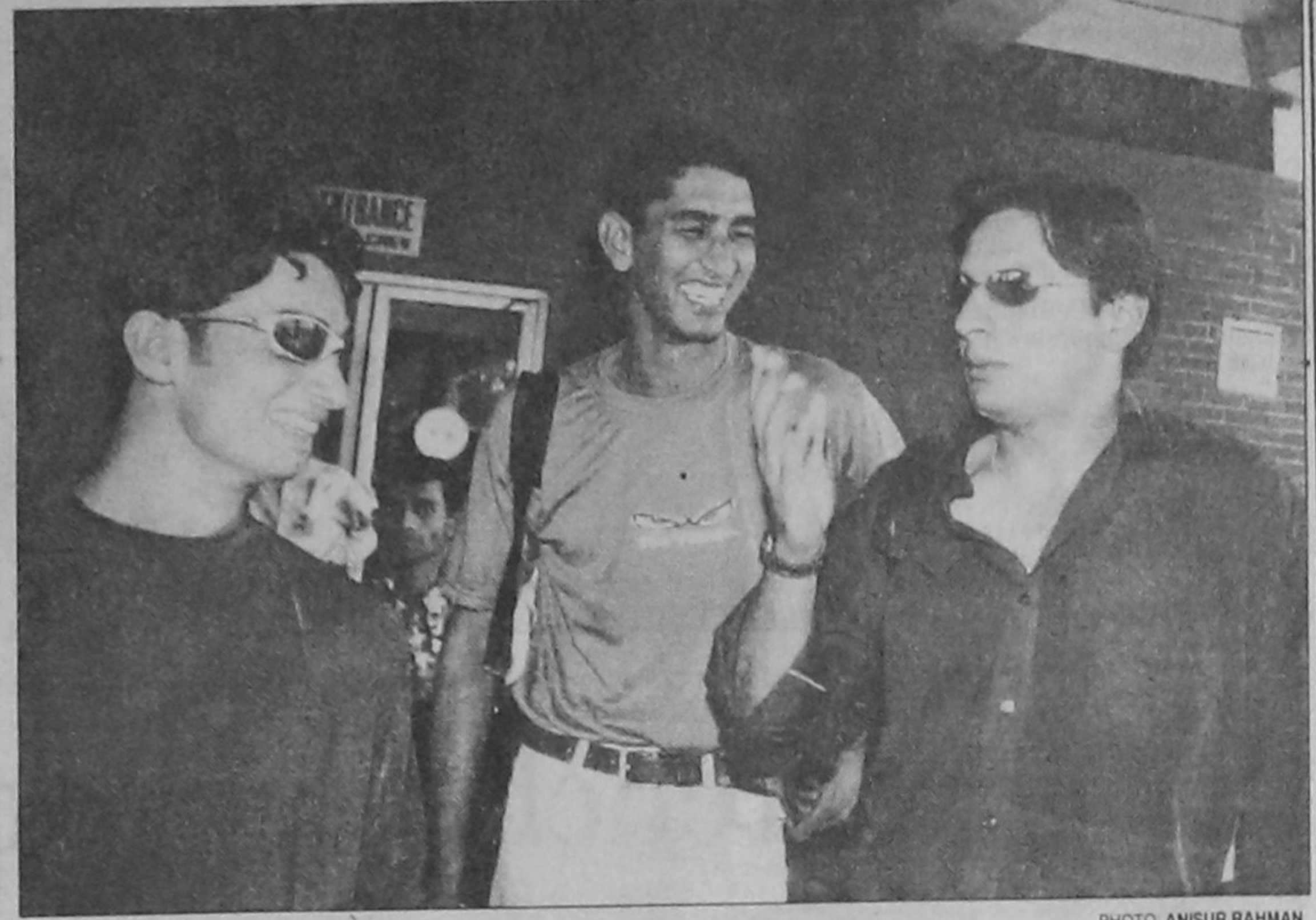
Pakistani opener Shahid Afridi (R) chats with teammates Imran Nazir (L) and Shabbir Ahmed on arrival at the Zia International Airport on Sunday.

OUR CORRESPONDENT, Rajshahi Rajshahi Krirangon and Primary Cricket Training Centre won their respective matches of the fourth Hasan Imam-Ali Imam Pintu Smriti cricket tournament at the Rajshahi Medical College Hostel playground yesterday. In the first match, Rajshahi Krirangon defeated Abdul Mannan Smriti by six wickets. Batting first, Abdul Mannan Smriti were all out for 116 in the allotted 22 overs. In reply, Rajshahi Krirangon reached the target losing four wickets in 17 overs.