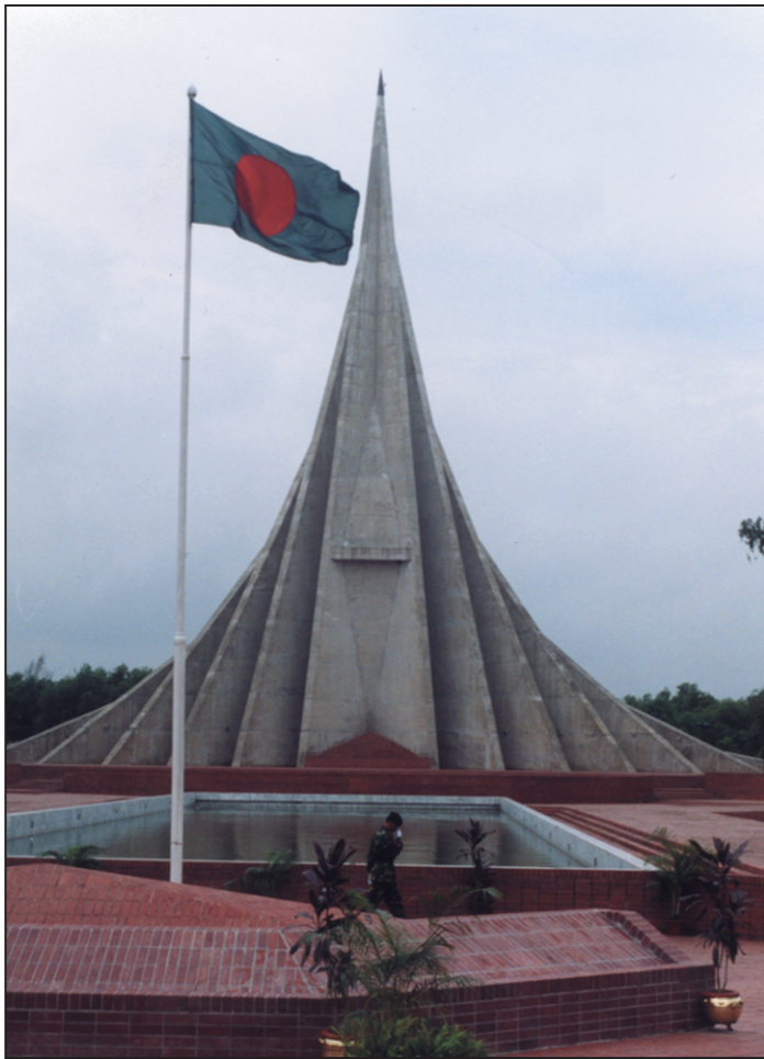
When dawn breaks today, people in their hundreds of thousands would throng the National Memorial at Savar to pay homage to the martyrs of the glorious War of Independence.