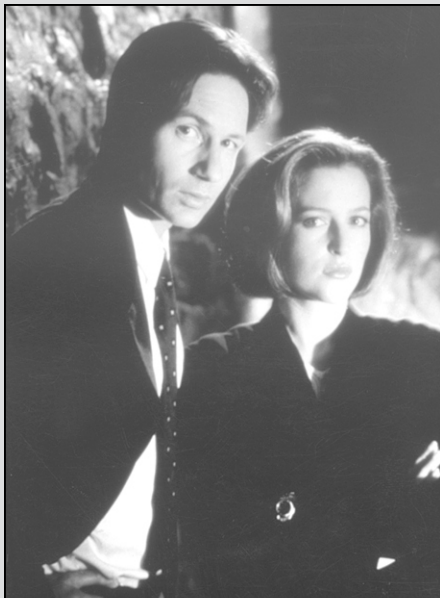
The X Files on Star World at 10:30p.m.

The Next Generation 12:30 Cops 1:00 Star News Focus Asia 2:00 The X Files 3:00 Creflo Dollar Daily 3:30 Kenneth Copeland Ministries 4:00 Life In The Word With Joyce Meyer 4:30 World News 5:00 Grace Under Fire 5:30 Mork & Mindy