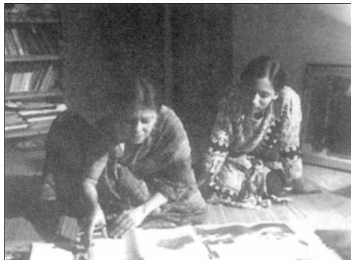
A still from Itihash Kanya by Shamim Akhter

The months of bloody-armed struggle that we had to endure in order to get our independence will remain ever living in our memories. But very few of those hard times were actually ever captured on the celluloid screen. Even in the 30 years of freedom that we have been enjoying, there has been few attempts at movies centering around those times. Eminent filmmakers as Zahir