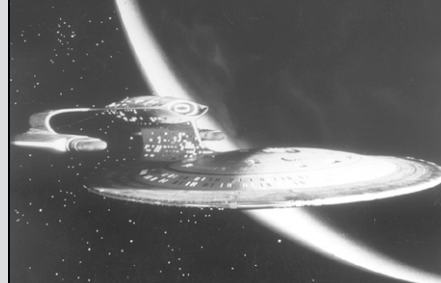
Star Trek - The Next Generation on Star World at 11:30p.m.

Prohor 11:30 Khabar / The News 11:45 Closing