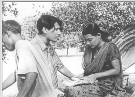
E Ki Khela (Episode 11) on Ekushey television at 9:15p.m.

3:00 Opening Announcement 3:15 Bengali Movie: Hangar Nadi Grenade 4:00 Khabar 6:00 Khabar 6:10 Taruchaya: Bengali folk songs 6:35 Programme from Chittagong station 7:00 News Headlines 7:05 Mati O' Manush: Agricultural development programme 7:25 Shataker Shatasmiti 8:00 News in Bengali 8:20 March - er Uttal Dinguli 8:30 Tora Shob Joyodhani Kor: Special drama on the occasion of Independence Day 9:00 News Headlines 9:10 Drama Serial: Fire Asha 9:30 Series: Team Knight Rider 10:00 Chayachanda 10:30 News in English 10:50 Protirodher Prothom