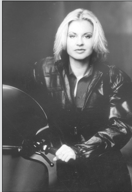
Team Knight Rider on BTV at 9:30p.m.

Bharat Bhromon 9:30 Swami Vivekanda 10:30 Apna Derjanya 11:00 Talk Jhaal Mishti 11:30 Netaji Subhash Chandra 12:00 Bidheshini Bodhu 12:30 Bhalobasa mondobasa 1:00 Ranna Ghar 1:30 Bhawani Purer Chattujee 2:00 Jemon Bolben Sir 2:30 Feature Film 5:00 Kellar Duniya 5:30 Daibaddho/Anand Vilas 6:00 Alpha Khabor 6:25 Jhankar 6:30 Mojar Khela Kobitate 7:00 Wah Ki Darun Drisha Kash Bitorka 7:25 Jhankar 7:30 Googly 7:55 Jhankar 8:00