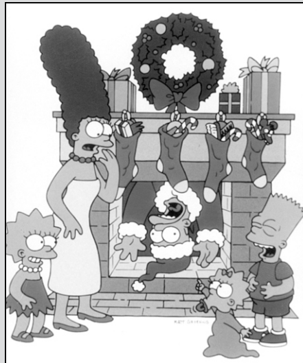
The Simpsons on Star World at 5:00p.m.

6:30 Dabaddho 7:00 Anand Vilas/Arghya 7:30 News Bulletin 8:00 Aalap 9:00 News Bulletin 9:05