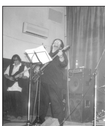
Aurthohin was the favourite

another favourite Guns N' Roses number 'Sweet Child O' Mine'. The