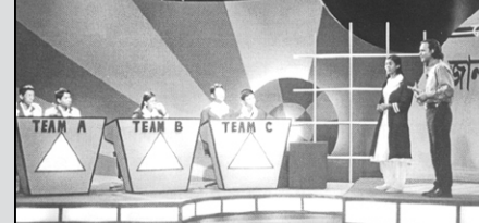
First semi final of White Plus Jana Ojana on Ekushey television at 7:00p.m.

With David Letterman 9:00 Emma 10:00 Dave's World 10:30 Police Academy 11:30 For Your Love 12:00 Jesse 12:30 Movie Stars 1:00 Suddenly Susan 1:30 La Femme Nikita 2:30 Veronica's Closet 3:00 Here's Lucy 3:30 Emma 4:30 The West Wing 5:30 Touched By An Angel 6:30 Homicide-Life on the Street 7:30 Heartbreak High 8:30 Here's Lucy 9:00 Royal Canadian Air Force 9:30 Kennedy 10:30 The West Wing 11:30 Late Show With David Letterman 12:30 Here's Lucy 1:00 Homicide Live on the Streets 2:00 Kennedy 3:00 Music Zone 4:00 Heartbreak High 5:00 Original Sound Track 5:30 Music Zone