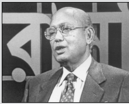
Sharashari on Ekushey television at 9:45p.m.

Prohor 11:30 Khabar / The News 11:45 Closing