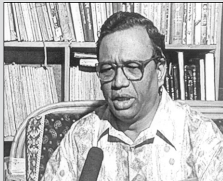
Charidike on Ekushey television at 6:30p.m.

4:00 World News 4:30 World Sport 5:00 CNN World View 5:30 Inside Asia 6:00 World News 6:30 The Artclub 7:00 CNN World View 7:30 World Beat 8:00 Larry