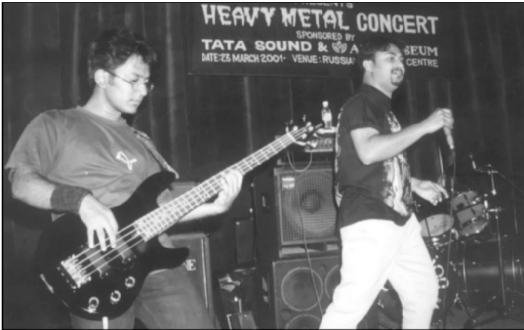
X-Uranium performing at the concert

The crowd greeted the band as they started off with their own number 'Pother Zhuui'. The beat of double bass drums and guitars gave the audiences an Iron Maiden feel. Night Mare played another own number 'Probu' next. The audience started to warm up and bang with the music. The first English song of the evening was 'Running Free' an Iron Maiden number. They performed it in an excellent way. The music was perfect. 'Ghumanto Sarir Ishara', was next. After this song there was a short break for the azaan. But this short break turned out to be not-so-short at all. As the band prepared to start again they faced a major problem with the voltage and it took a while to fix it. Night Mare once again started