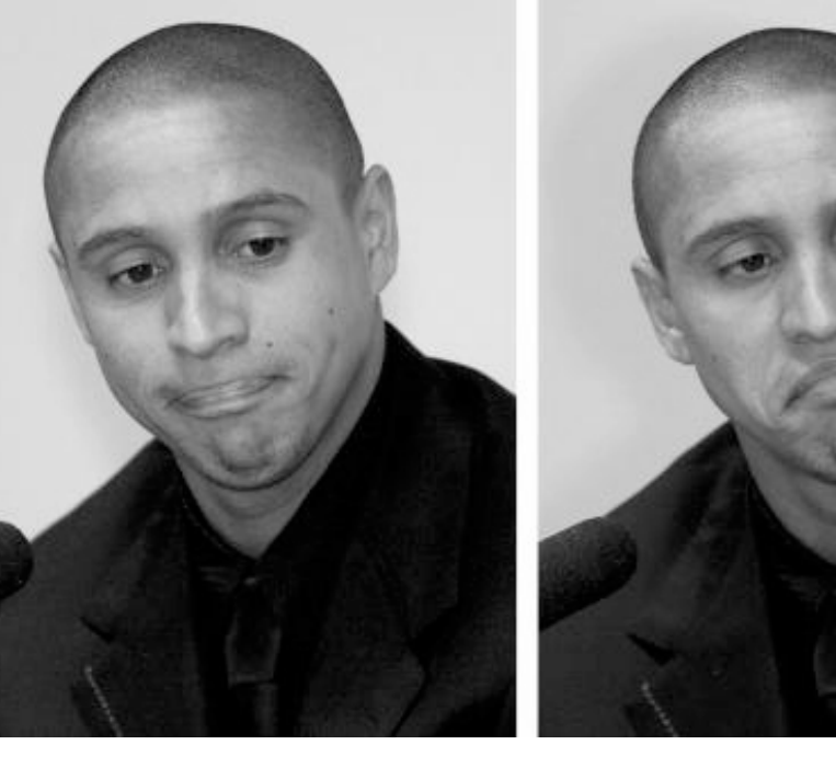
A combo of photos showing Brazilian superstar Roberto Carlos grimacing during his testimony before a