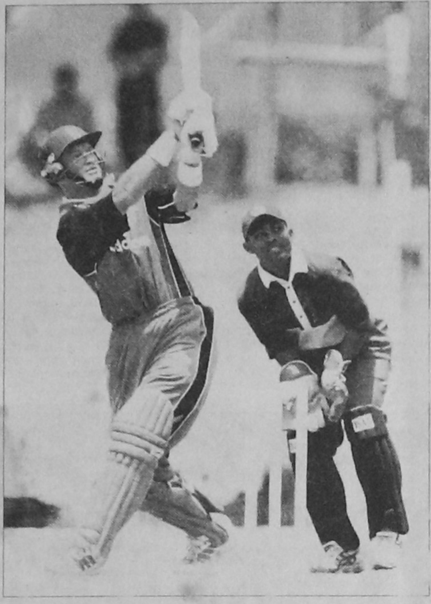
England's Graeme Hick in full flow during a magnificent 100 against the Sri Lanka Board President's XI on Wednesday.