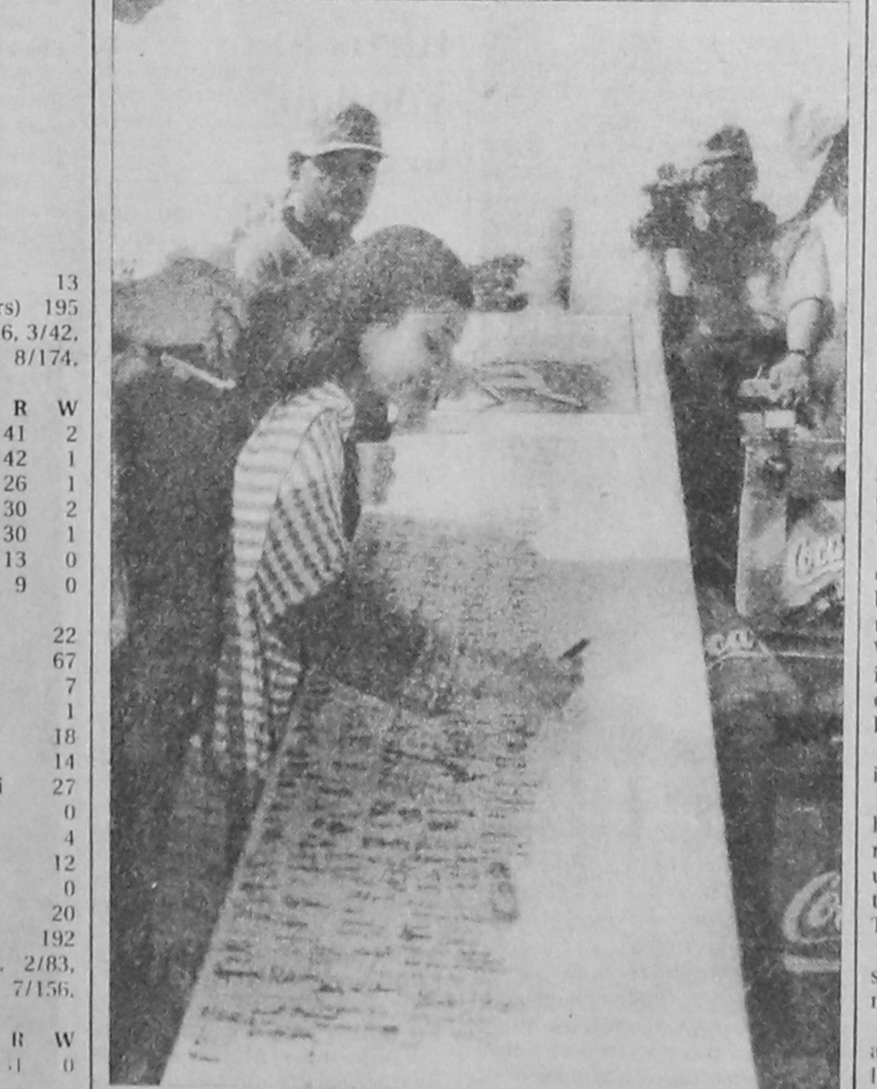
ANOTHER LUCKY CHARM: A young lady signs the Coca Cola 'Good Luck Bat' at the Teachers Students Centre (TSC) at Dhaka University yesterday. The giant bat, sponsored by Coca Cola Far East Ltd. have already travelled through Chittagong and has started its journey in Dhaka collecting good wishes for the Bangladesh national cricket team which will embark on their first overseas Test tour to Zimbabwe in April.