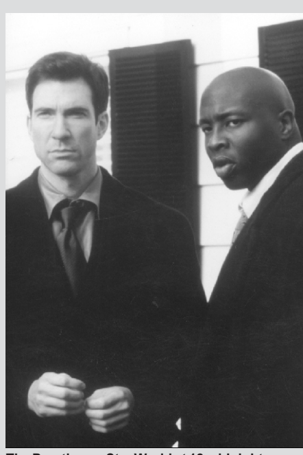
The Practice on Star World at 12 midnight

This World 7:30 Music Zone 8:00 Late Show With David Latterman 9:00 Dave's World 9:30 Out Of This World 10:00 Music Zone 10:30 Heartbreak High 11:30 Homicide-Life on Street 12:30 All My Children 1:30 Capitol 2:00 Three's Company 2:30 Friends 3:00 Veronica's Closet 3:30 Out Of This World 4:00 Dave's World 4:30 Here's Lucy 5:00 Three's Company 5:30