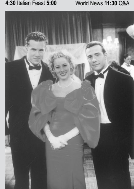
Two Guys, A Girl and A Pizza Place on Star World

CNN 4:00 CNN This Morning 4:30 Asia Business Morning 5:00 CNN This Morning 5:30 Asia Business Morning 6:00 CNN This Morning 6:15 Asia Business Morning 6:30 Asian Edition 6:45 Asia Business Morning 7:00 CNN This Morning 7:30 Moneyline 8:00 Larry King Live 9:00 World News 9:30 World Sport 10:00 World News 10:30 Showbiz Today 11:00