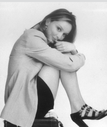
Ally McBeal on Star World at 11:00p.m.