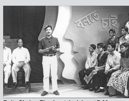
Bolte Chai on Ekushey television at 7:00p.m.