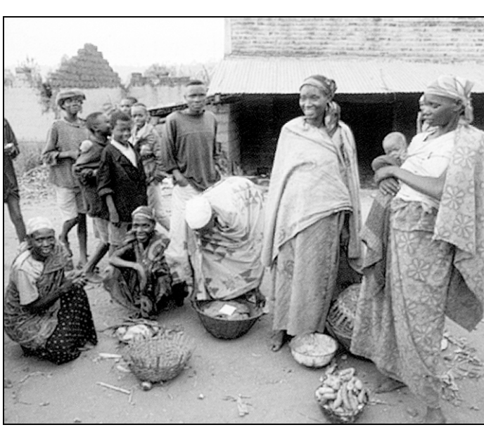
French Speaking women contributing to the economy of their country

"In the second part of the exhibition is the discussion of the diversity of the language. Words are taken from other languages like words that come from England, Italy and Greenland, while French has been spread to other countries as France had colonies in Africa and representation in India (Pondicherry). Today French is spoken in Quebec, Cambodia, Laos, Vietnam and countries in Africa. There is the L'Academie