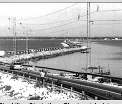
Charidike: Dipaboli on Eksuhey television at 6:30p.m.

Khela 2:40 Drishti 3:00 Ekushey Headlines 3:05