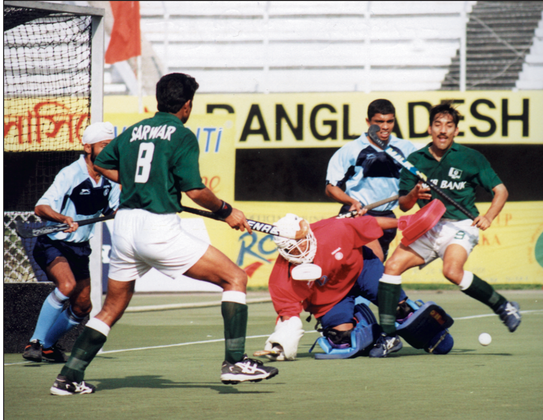
A diving Indian goalkeeper tries to thwart a Pakistan attack during yesterday's Prime Minister Gold Cup Hockey Championship final at the Moulana Bhasani National Stadium. India lifted the title, beating their arch-rivals 3-2 in penalty shootout after the regulation and extra periods ended 3-3. (Story on page 13)