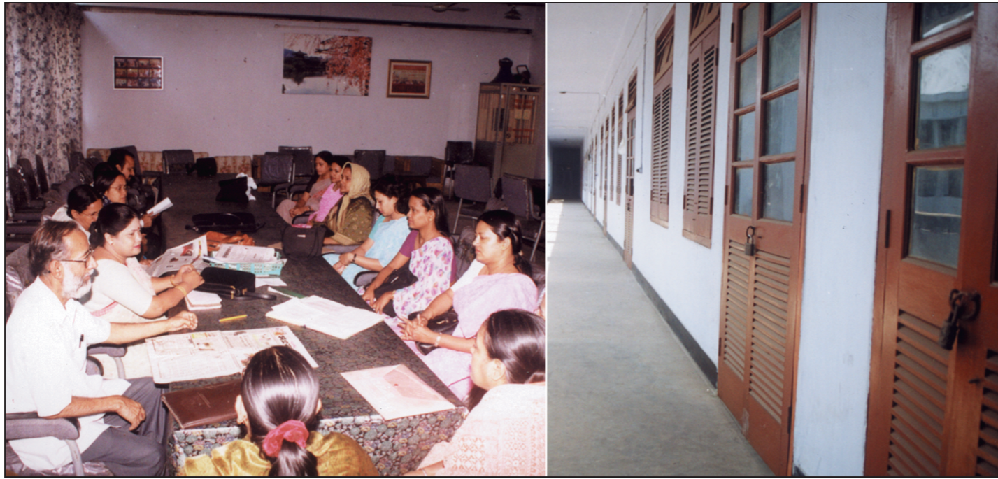
With teachers whiling away time at the lounge and classrooms under lock and key, Eden Girls College wore a deserted look yesterday. Teachers of government colleges and madrassahs skipped classes for the second consecutive day of the three-day boycott to press home their demands.