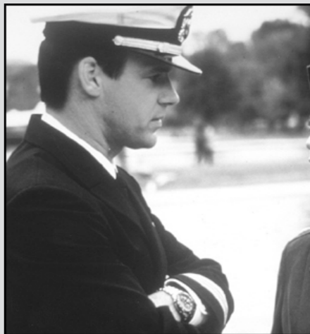
JAG on Star World at 10:00p.m.

6:00 Zee Music Plus 7:00 Aalap 7:30 Tararun 8:30 Hit Pe Hit 10:30 Hit Mix 11:00 Cool-Age 11:30 Zee Music Box 12:00 Zee Music Plus 1:00 Hit Pe Hit 2:00 Jharokha 2:35 Artist Of The Fortnight 3:05 Tararun 4:00 Hit Pe Hit 5:00 Zee Music Box 5:30 Hit Mix 6:00 Compact Disc 6:30 Zee Music Plus 7:30 Hit Pe Hit 8:30 Just Jammin 9:00 Dil Se 9:30 Zee Music Box 10:00 Sizzlers 10:30 Jharokha 11:05 Fillers 1:00 Phoren Maal 12:35 Shabab 1:35 Zee Music Box 1:30 Jharokha 2:00 Hit Pe Hit 3:00 Artist Of The Fortnight 3:30 Tararun 4:30 Phoren Maal 5:30