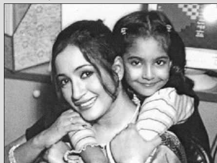
New drama serial: He Bandhu Biday (Episode-1) on Ekushey television at 8:00p.m.

3:00 Opening Announcement 3:30 Live telecast of the Final match of the Prime Minister Gold Cup - 2001 hockey tournament from Maulana Bhashani National Stadium 4:00 Khabar 4:50 Pustitithiya 5:10 Lal