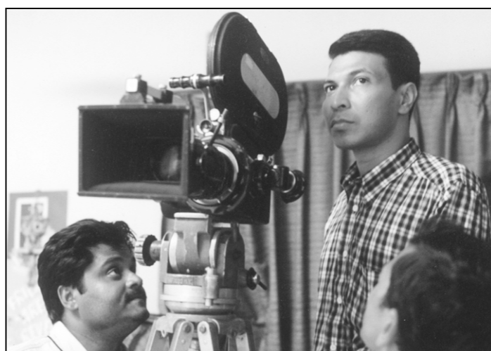
A scene of the film in the making with its director AKM Zakaria

cal. We see films as an art and not business. If the film sells, fine. But my main aim is not to make it a commercial success. I hope to make a film next year on social conditions like 'Salma' which has taken up all my savings. As I had no financial backer. Government could easily spare modest amount for art films which cost much less and mean so much more. The short film trend in Bangladesh dates back from the 80s. Overseas it is not difficult to get patrons for alternative films. Even in India the national TV sponsors short films as creative exercise. Internationally too there is scope for short films. To print my eight minute film I had to go to Madras. To subtitle it I'll again have to go to Bombay. Normally the Bangladesh government helps in case of making subtitles for foreign screening but this involves red tapeism which I don't have the time