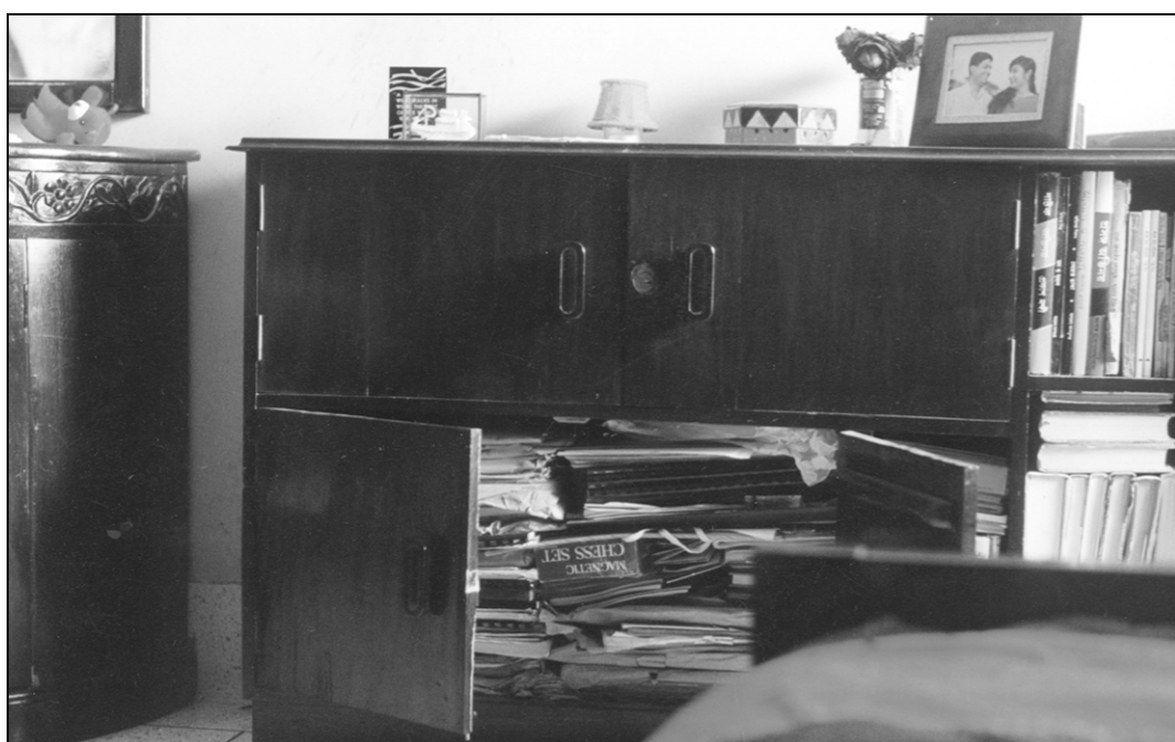
No characters to be found in the silent scenario

days. Today he works in the editorial section of a national daily. He made a video film on Buriganga and another documentary titled "State and Democracy."