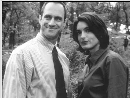
Law & Order: Special Victims Unit on Star World at 8:00p.m.

6:30 Animal Survivors 7:00 In Care of Nature Series I & II 8:00 Without Warning I 8:30 Lonely Planet IV 9:30 Beyond 2000 10:00 The Quest 10:30 Go For It! 11:30 Intimate Escapes 12:00 Intimate Escapes 12:30 Wild Discovery 1:30 Medical Detectives I 2:00 Medical Detectives I 2:30 Lifeline 3:30 Animal Survivors 4:00 In Care of Nature Series I & II 4:30 Outer Bounds I & II 5:00 Without Warning I 5:30 Lonely Planet IV 6:30 Let's Dance/There's No Food Like My Food 7:00 Real Kids, Real Adventures 7:30 Wild Discovery 8:30 Hunters 9:30 Trauma IV