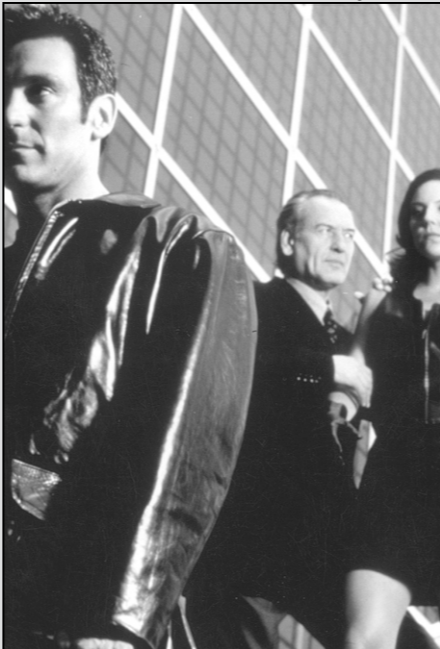
The Pretender on Star World at 11:00p.m.

8:30 Bollywood News 9:00 Baba Taranath (Biswajit, Sandhya Roy) 12:00 Geet Bahar 12:30 An Evening in Paris (Shammi Kapoor, Sharmila Tagore) 3:30 Bollywood News 4:00 Kartavya (Dharmendra, Rekha) 7:00 Geet Bahar 7:30 Mangal Masti- Lahu Ke Do Rang (Vinod Khanna, Shabana Azmi) 10:30 Bollywood News 11:00 Dilruba (Dev Anand, Rehana) 12:30 Dilruba