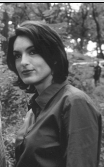
Law & Order: Special Victims Unit on Star World at 8:00p.m.

4:00 CNN This Morning 4:30 Asia Business Morning 5:00 CNN This Morning 5:30 Asia Business Morning 6:00 CNN This Morning 6:15 Asia Business Morning 6:30 Asian Edition 7:00 CNN This Morning 7:30 Moneyline 8:00 Larry King Live 9:00 World News 9:30 World Sport 10:00 World News 10:30 Showbiz Today 11:00 World News 11:30 Q&A (Replay) 12:00 World News 12:30 World Report 1:00 World News 1:30 World Sport 2:00 World News 2:30 Insight 3:00 Larry King Live (Replay) 4:00 World News 4:30 Biz Asia 5:00 Asia Tonight 5:30 World Sport 6:00 World News 6:15 Asian