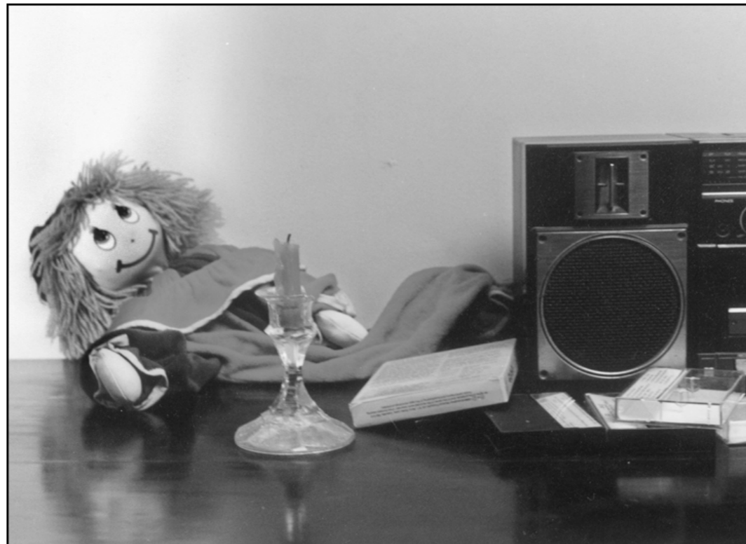
The abandoned house speaking of its inhabitants