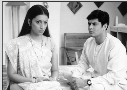
Kyunki Saas Bhi Kabhi Bahu Thi on Star Plus at 11:00p.m.

6:30 Iska Bonaer Bibi 7:00 Monihaar 7:30 News Bulletin 8:00 Aalap 9:00 Film 4:00 Ek Akasher Niche 4:30 Nanyantara 5:00 Ingeet 5:30 Football 6:00 Moni Niye