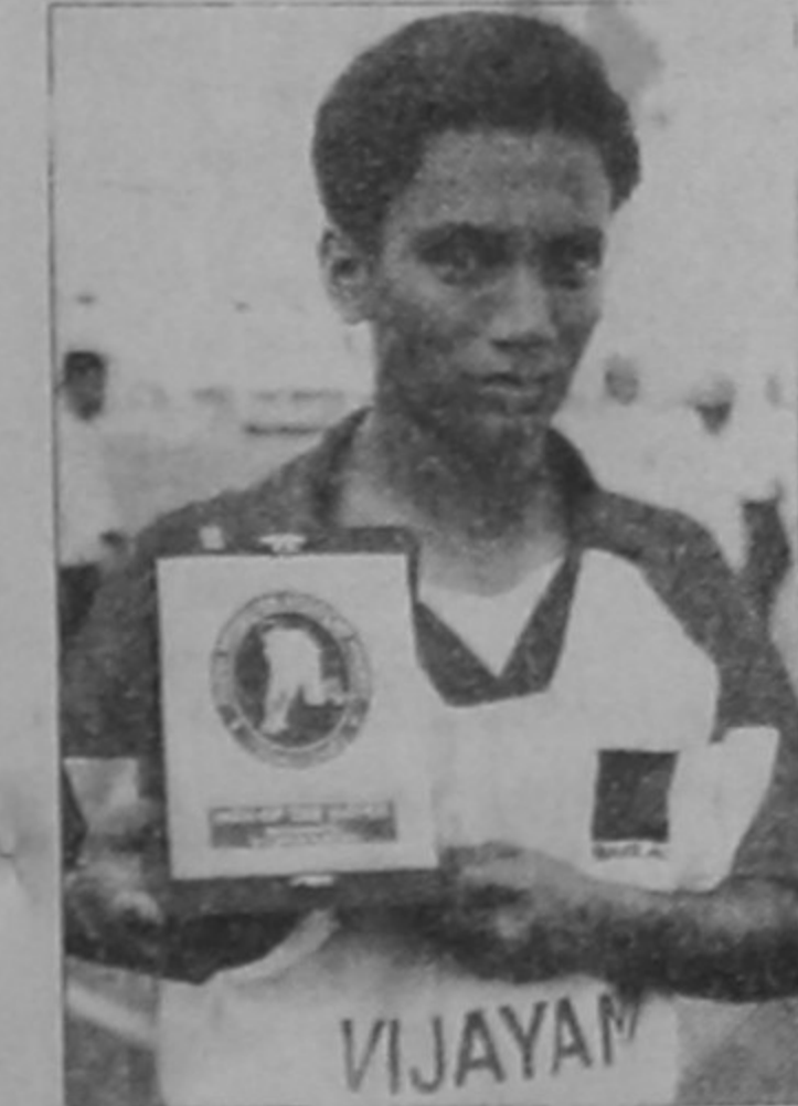
SHUVO ... m-o-m

Malaysia tried their best to find an equaliser but failed to break down the stubborn Bangladesh