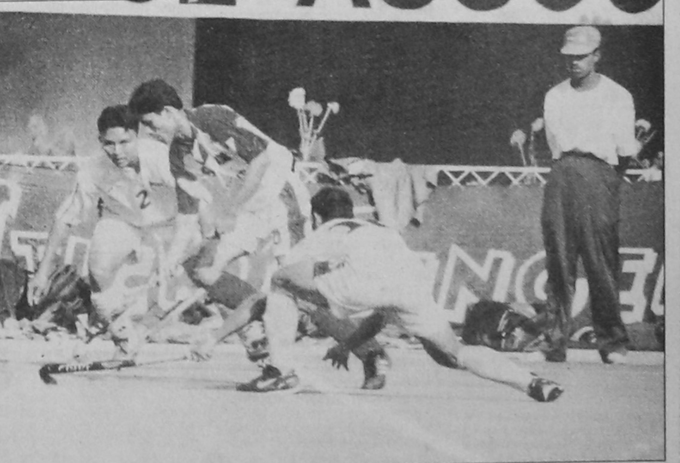
Action from Monday's Prime Minister Gold Cup Hockey Tournament classification encounter between Bangladesh and Malaysia.