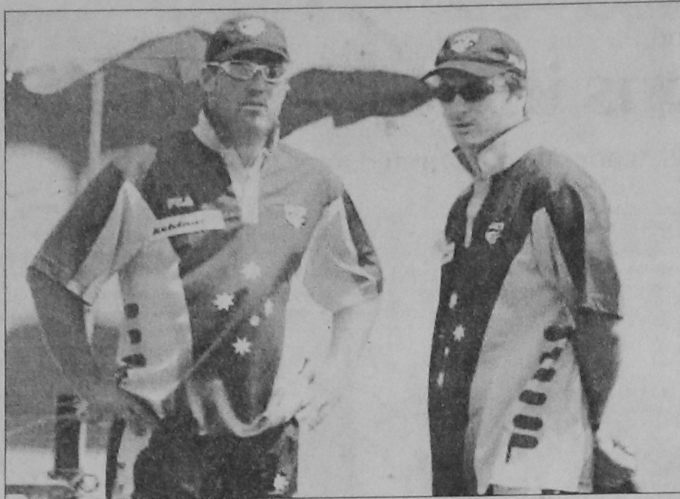
Australia captain Steve Waugh (R) and leg-spinner Shane Warne discuss something during a practice session at Madras on Saturday. They meet India in the third and final Test here starting today.