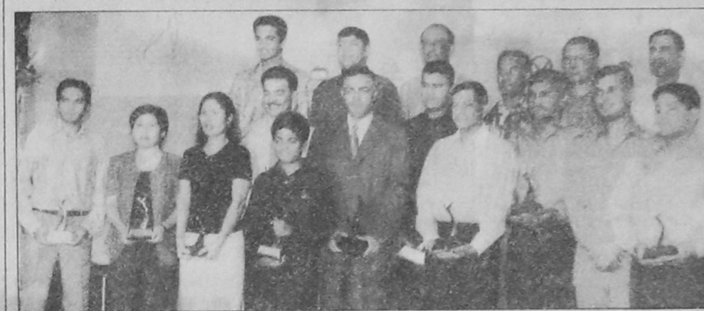
The winners of Summit Cup Golf Tournament (Pro-Am) pose at the Kurmitola Golf Club on Friday.