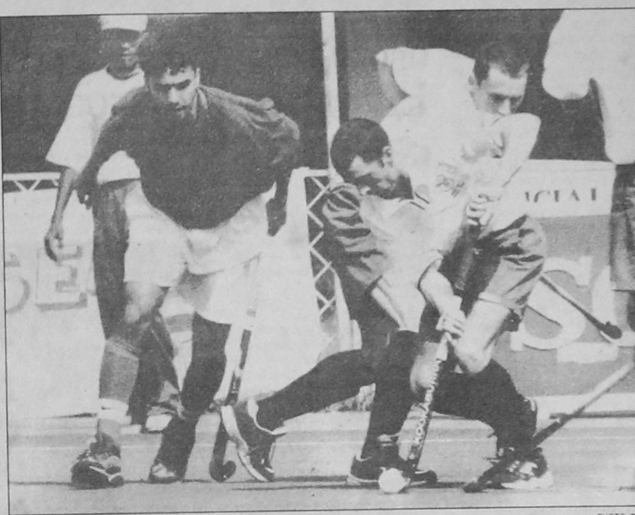
An Ireland player (R) takes control of the ball during their Prime Minister Gold Cup hockey match against Egypt at the Maulana Bhasani Stadium on Friday.