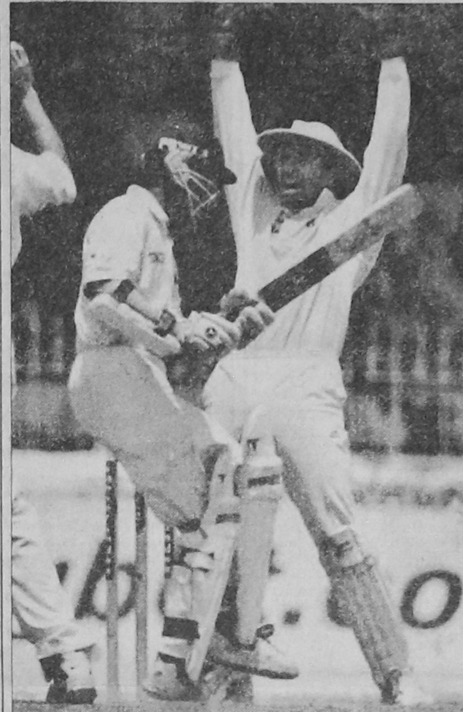
England wicketkeeper Alec Stewart appeals unsuccessfully for an lbw against Sri Lanka's Kumar Sangakkara on the opening day of the third and final Test in Colombo on Thursday.

AFP, Colombo England hit back strongly through spinners Ashley Giles and Robert Croft to reduce Sri Lanka to 221 for seven on the first day of the third and final Test on Thursday. Sri Lanka were cruising at 205 for three when the dismissal of Aravinda de Silva for 38 sparked off a collapse that saw four wickets tumble for just 14 runs off England's spinning duo.