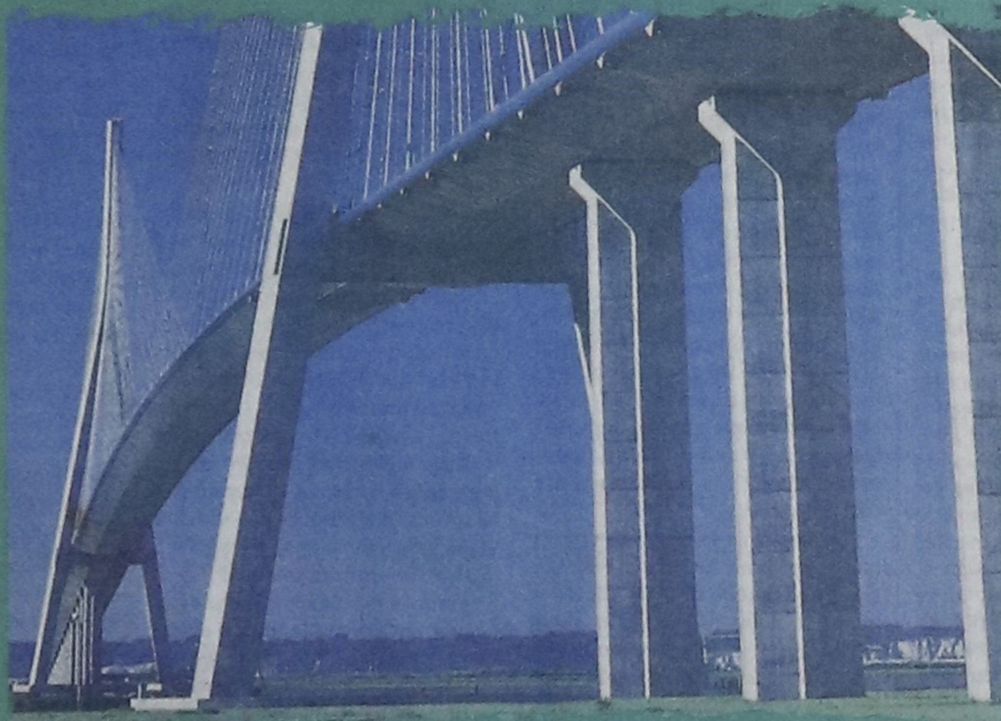
The Normandy Bridge, France Built: 1995 Distance: 2.14 km