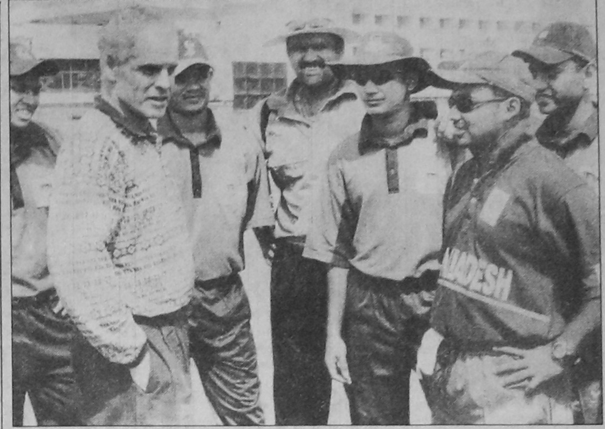
New national cricket coach Trevor Chappell having a chat with his would-be charges during his visit to the BKSP on Wednesday.