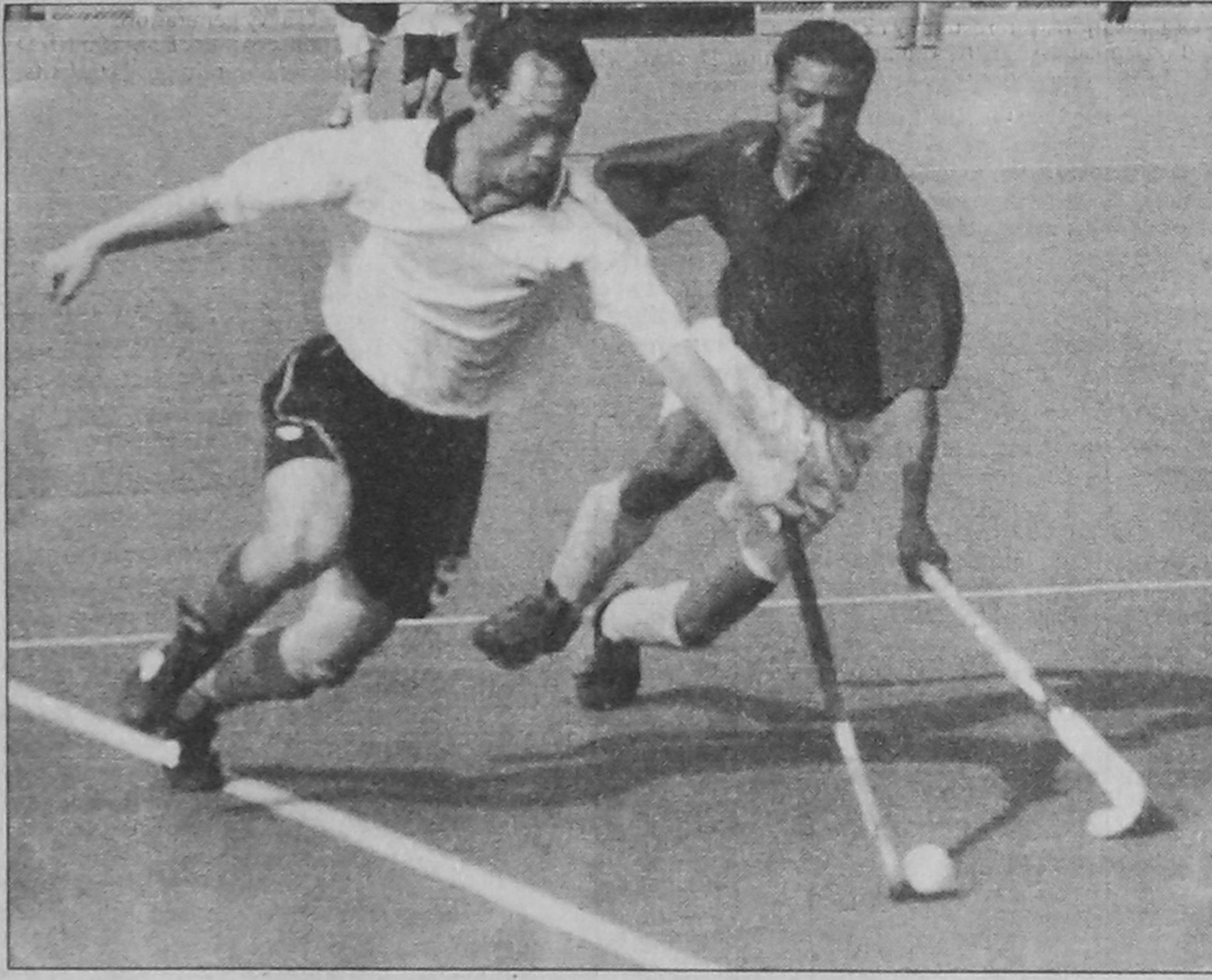
Action from Wednesday's Prime Minister Gold Cup Hockey Tournament encounter between China and Egypt at the Maulana Bhasani National Stadium.