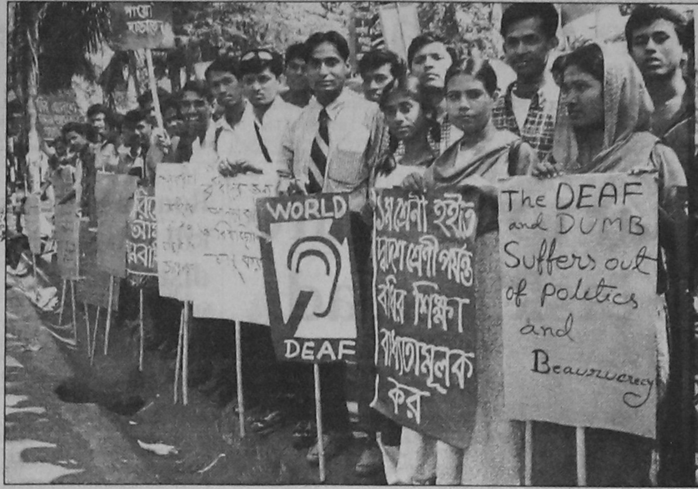
Committee for the Protection of the Rights of the Deaf and Dumb of Bangladesh formed a human chain in front of the National Press Club yesterday prior to submitting a memorandum to visiting UN Secretary General Kofi Annan.