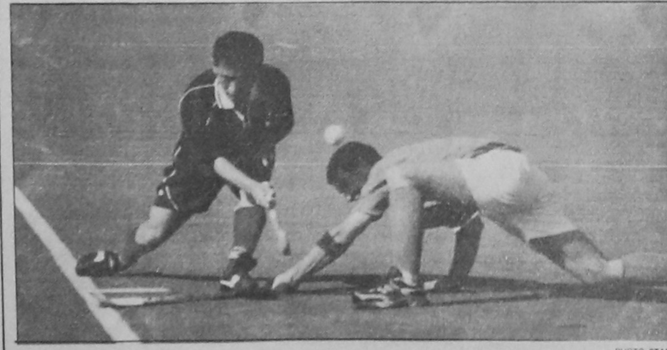
Action from yesterday's Prime Minister Gold Cup hockey match between China and Ireland at the Moulana Bhasani Stadium.