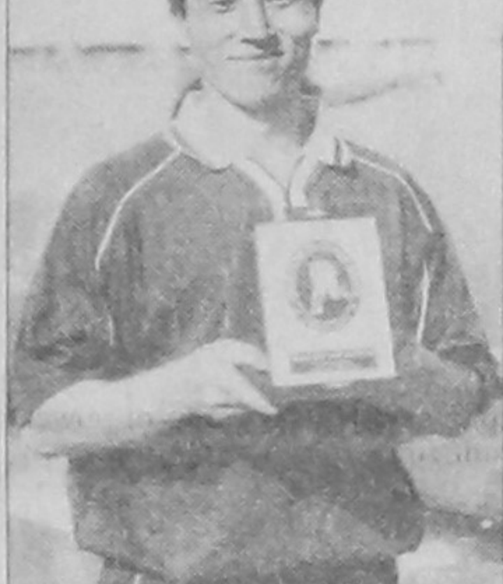
REN BAobe ... m-o-m