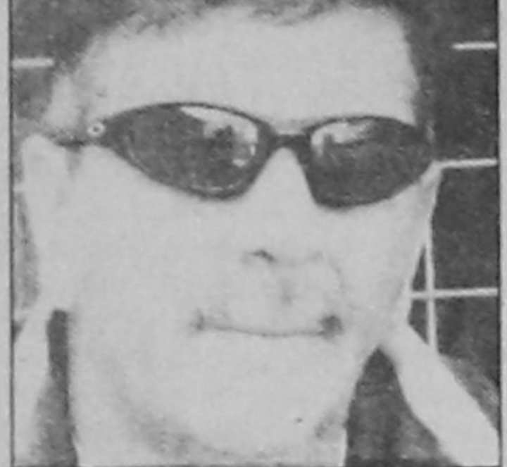
Rodney Marsh (Former Australian stumper) "A wicketkeeper is a captain's faithful servant."