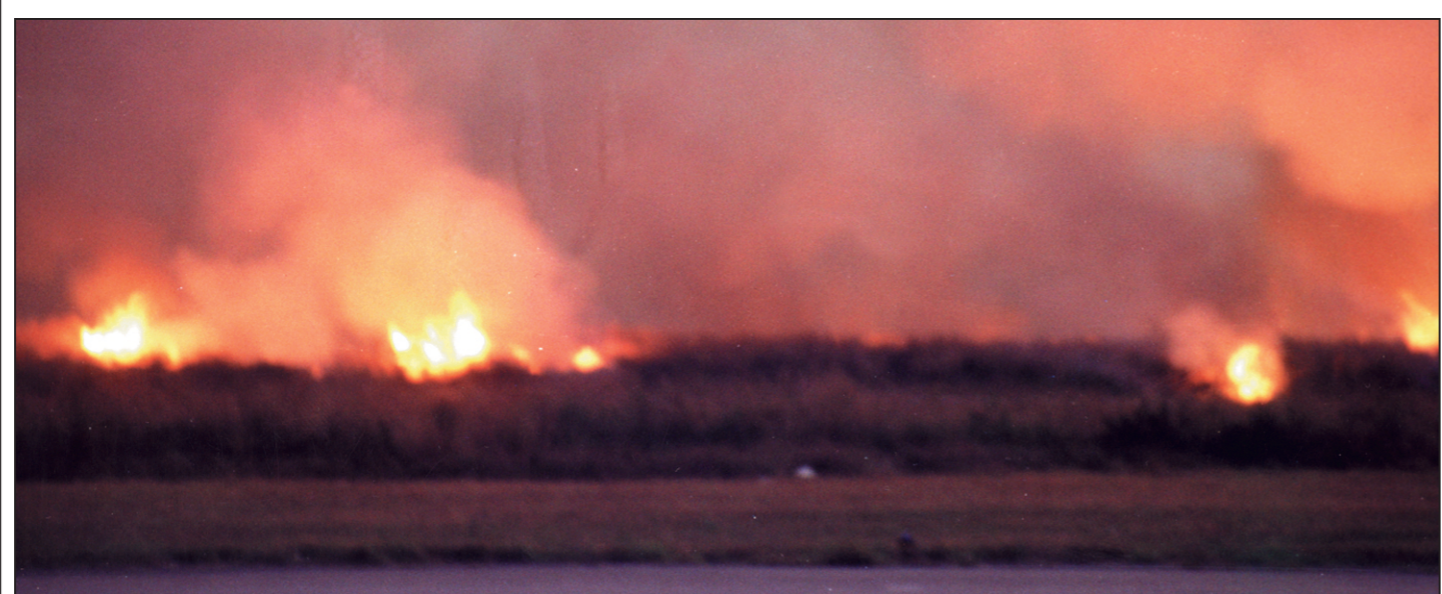
A bush fire broke out on the north-western side of the runway at Zia International Airport yesterday for the second time in two days. The fire, detected at 5:00pm and put out by 6:00pm, is suspected to have originated from a burning cigarette thrown into either dry grass or bush. Fortunately, no damage was done as the aircraft were beyond the fire's reach. Earlier on Saturday morning, fire service put out another fire at the same place.

In absence of political leaders, foreign envoys and delegates distributed leaflets at Kutukchhari Bazar and adjoining villages also SEE PAGE 11 COL 4