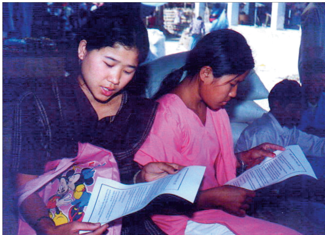
Two tribal young women at Kutukchhari Bazar in Rangamati read the leaflet seeking cooperation in securing release of three European hostages yesterday. The leaflet contains texts in Bangla, English and Chakma.

The meeting with Khaleda would SEE PAGE 11 COL 8