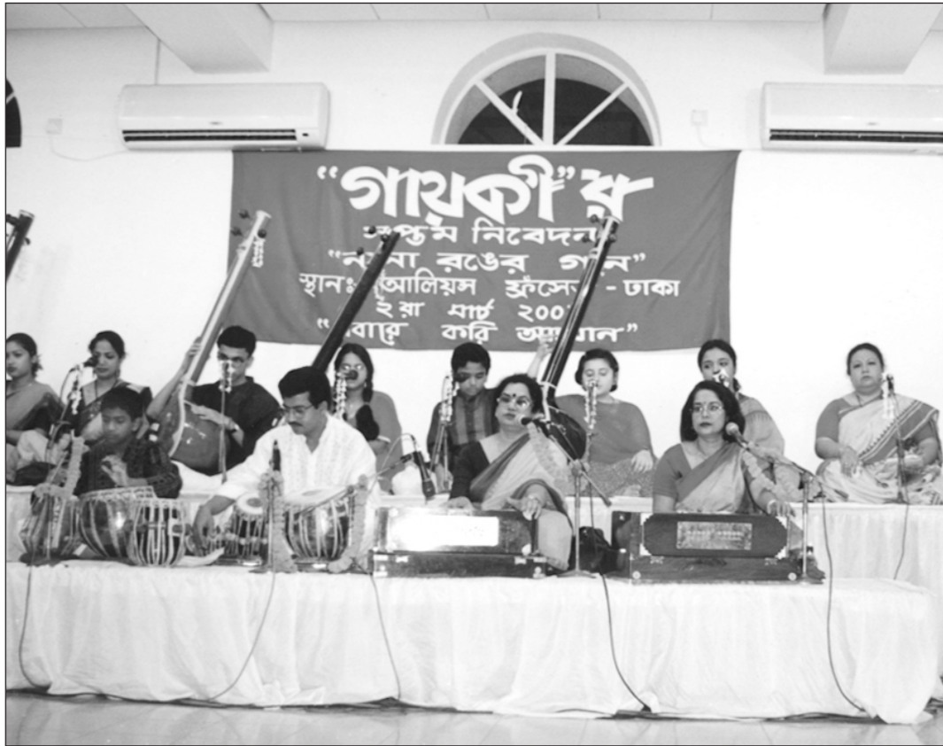
Gayaki presents its seventh musical evening at Alliance Francaise on March 2.