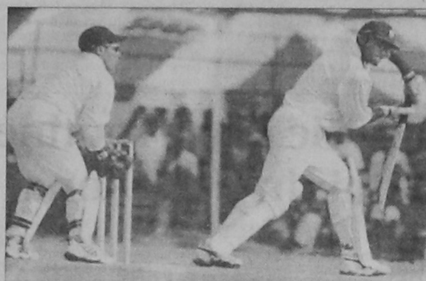
West Indies captain Carl Hooper plays defensively on the first day of the first Test against South Africa on Friday.