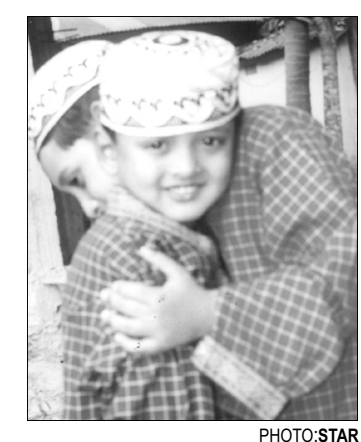
Two children embracing each other on the occasion of Eid-ul-Azha in Magura town.