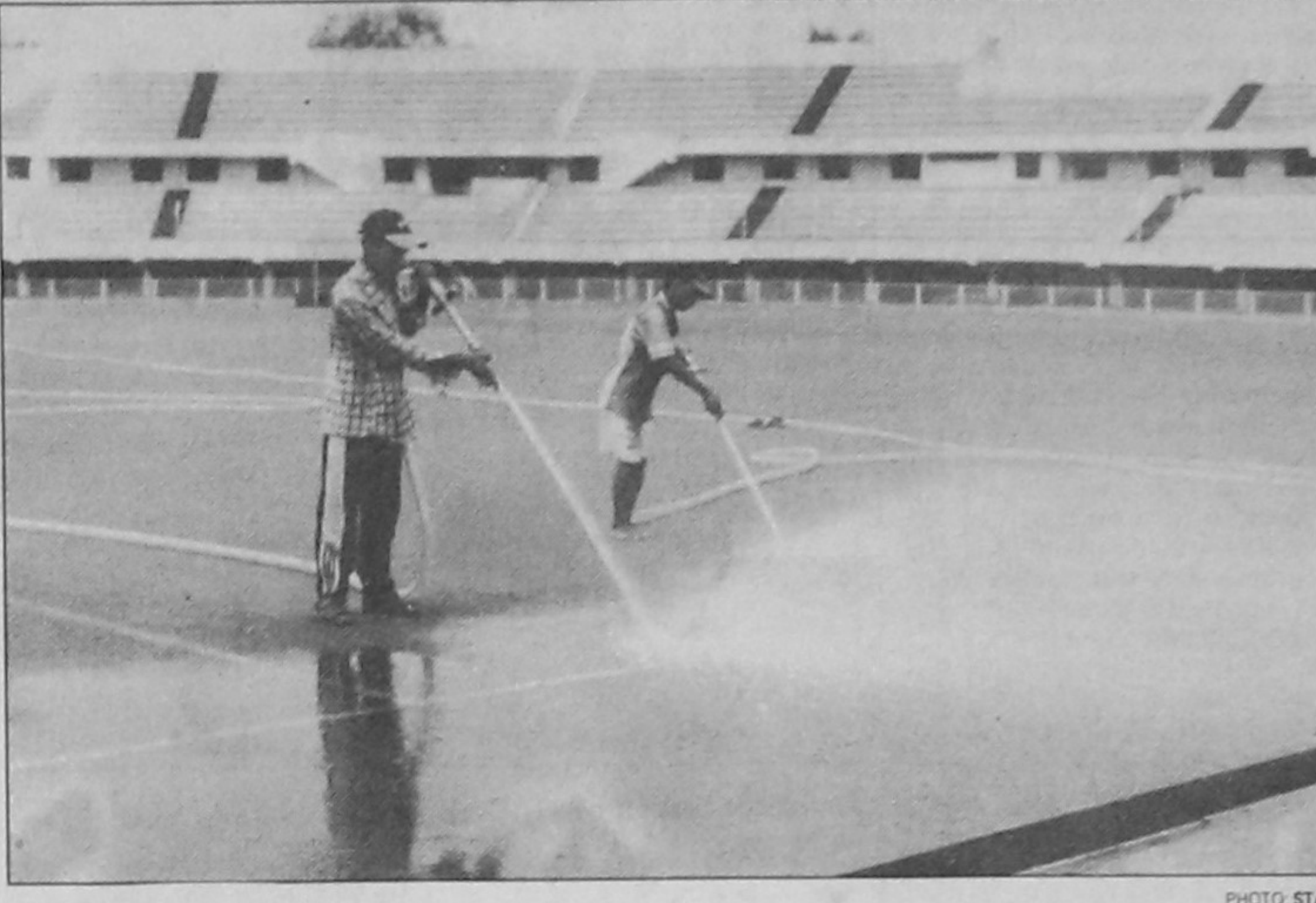
Groundsmen removing dirt from the surface of the astro-turf of the Moulana Bhasani National Hockey Stadium yesterday. The nine-nation Prime Minister's Gold Cup Hockey Tournament begins at the stadium on March 10.