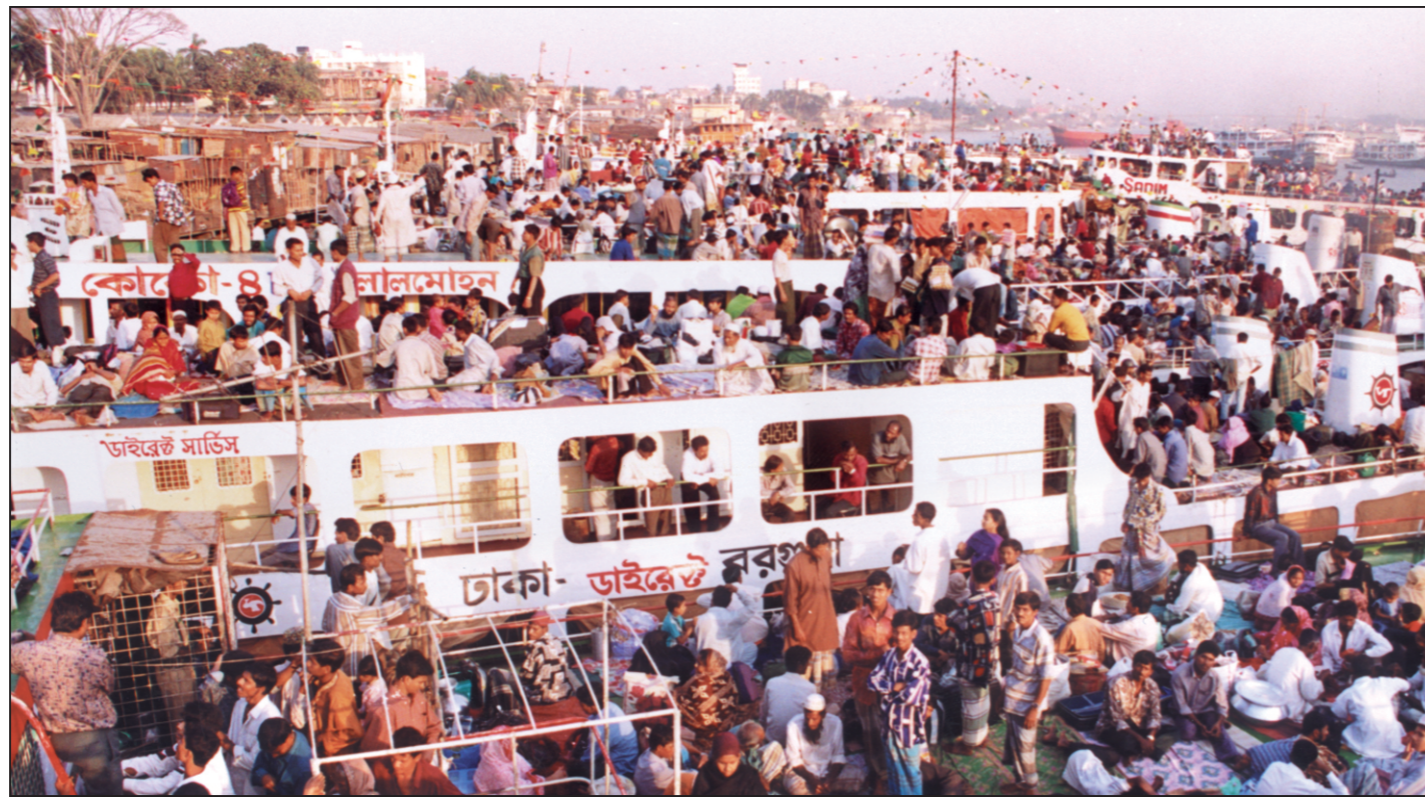
Cashing in on the mad rush of homebound people, launch owners have resorted to the old habit of loading the passenger-carriers beyond their capacity. There is a ban all right; but neither the passengers nor the launch owners care while the authorities remain indifferent as ever.