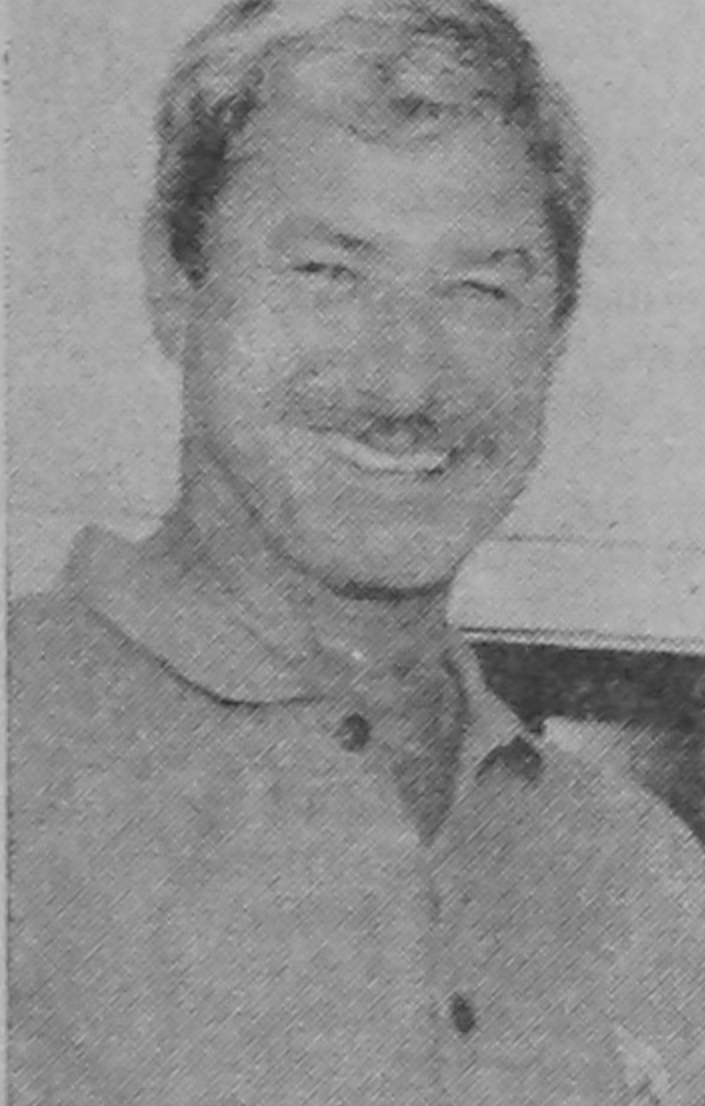
Sir Richard Hadlee (New Zealand Cricket's chief selector)

"We believe he is the best man for the job."