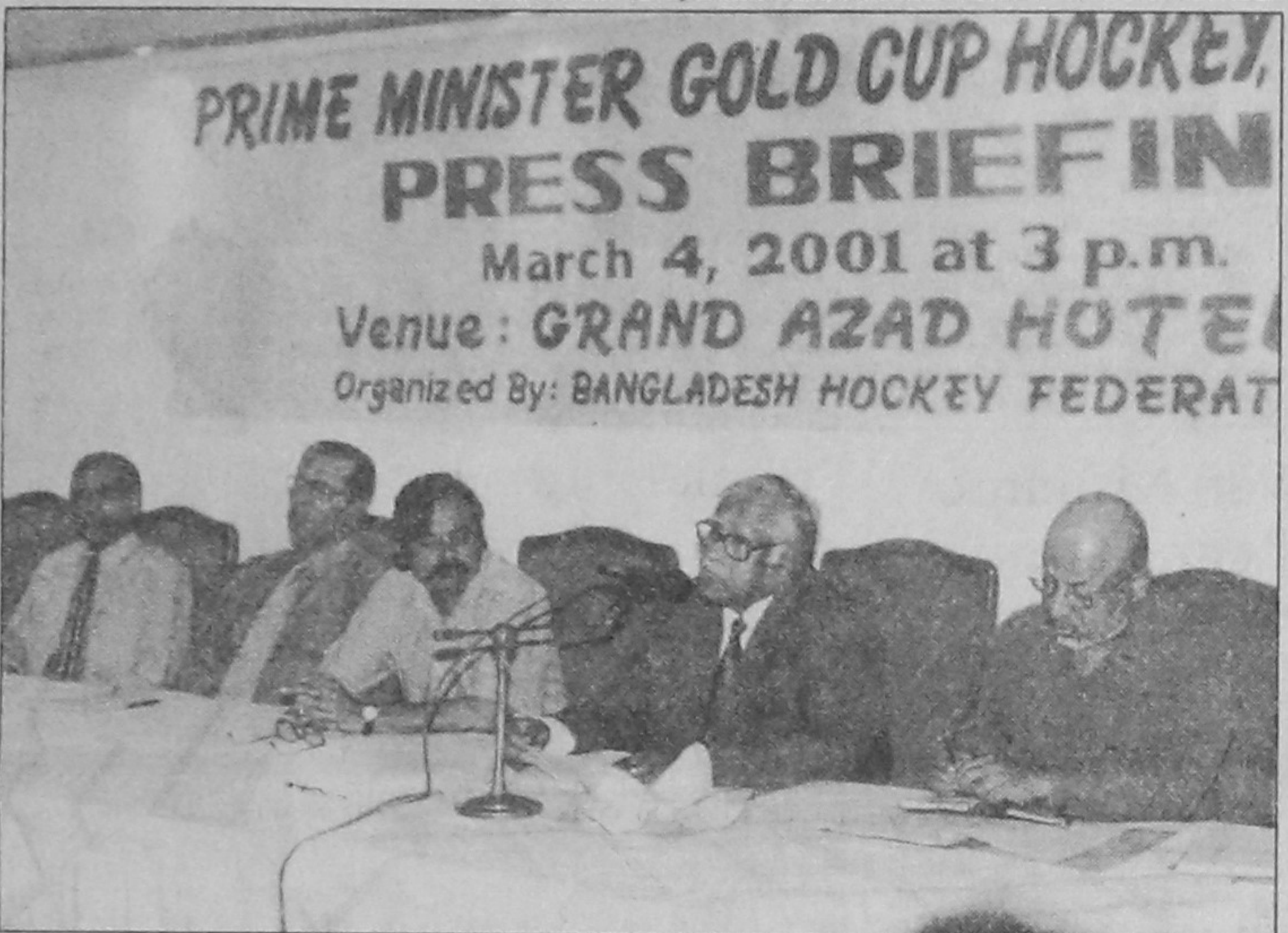
Commerce Minister Abdul Jalil speaking to reporters at a press conference organised in connection with the forthcoming Prime Minister's Gold Cup Hockey Tournament at a city hotel on Sunday.