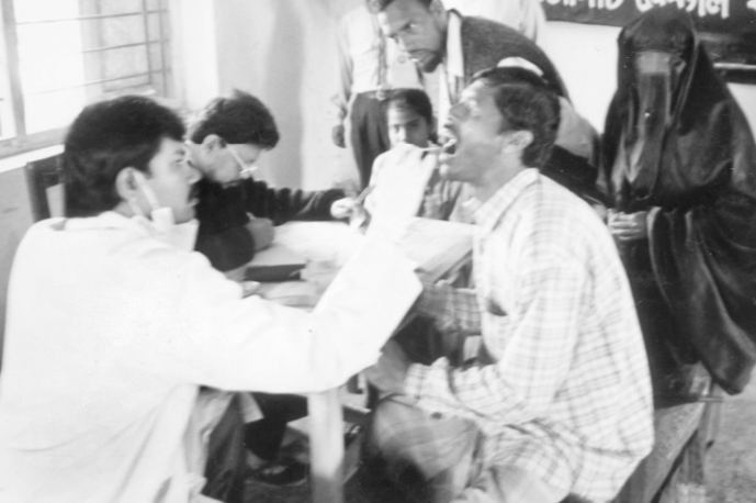
A daylong dental camp was jointly organised by Crystal Open Scout and University Dental College of Dhaka in Taltali High School of Amtali upazila under Barguna district recently. More than 500 poor patients received free treatment and medicine from the camp.