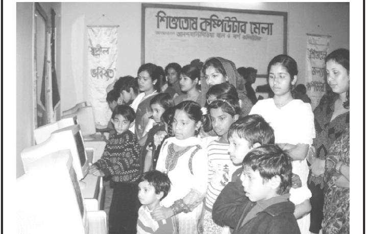
A three-day computer fair for children was jointly organised by Borno Computers and Ananda Multimedia School of Moulvibazar recently. The fair was held at the local Public Library auditorium.