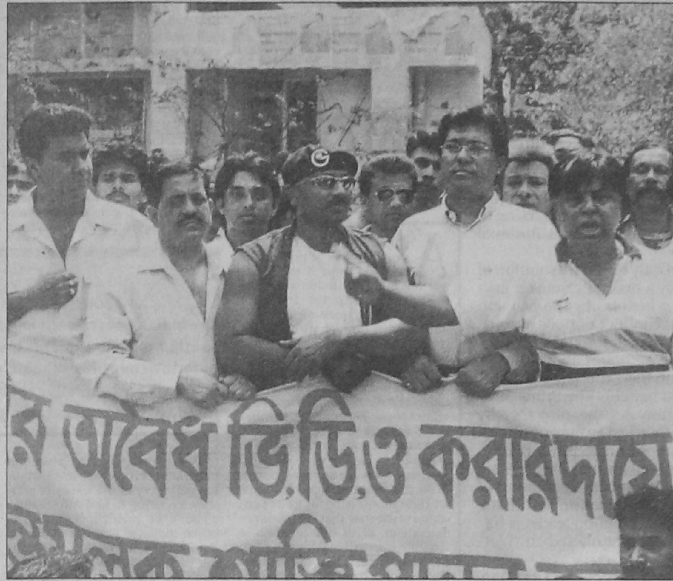
Bangladesh Film Artists Association members took to the streets yesterday demanding an end to the illegal video screening of local films and exemplary punishment to the persons involved in the process.

Police said the victim of the same upazila was abducted on Sept 7 last year from Isapur Bazaar Kheyaghat area.