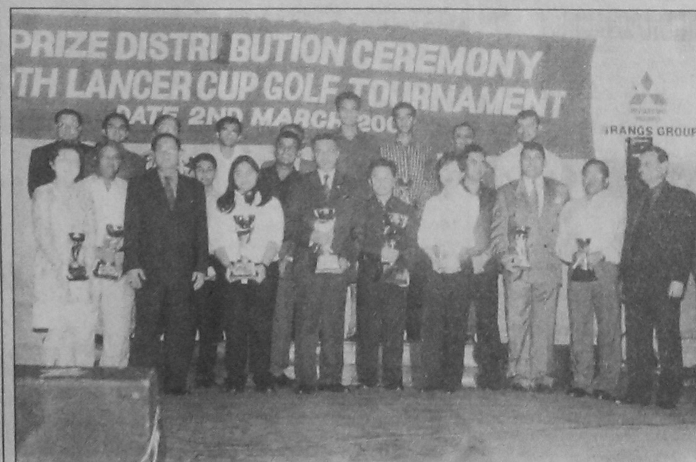
Winners of the 19th Lancer Cup golf tournament pose during the prize-giving ceremony at the end of the day-long meet at the Kurmitola Golf Club on Friday.