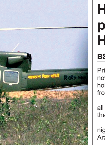
An army helicopter dropping troops near a bus stop at Rangamati yesterday. The abductors promised to free the three hostages before the government's deadline ends at midnight tomorrow.

British High Commission, said the hostage crisis is at a "very delicate stage" now.