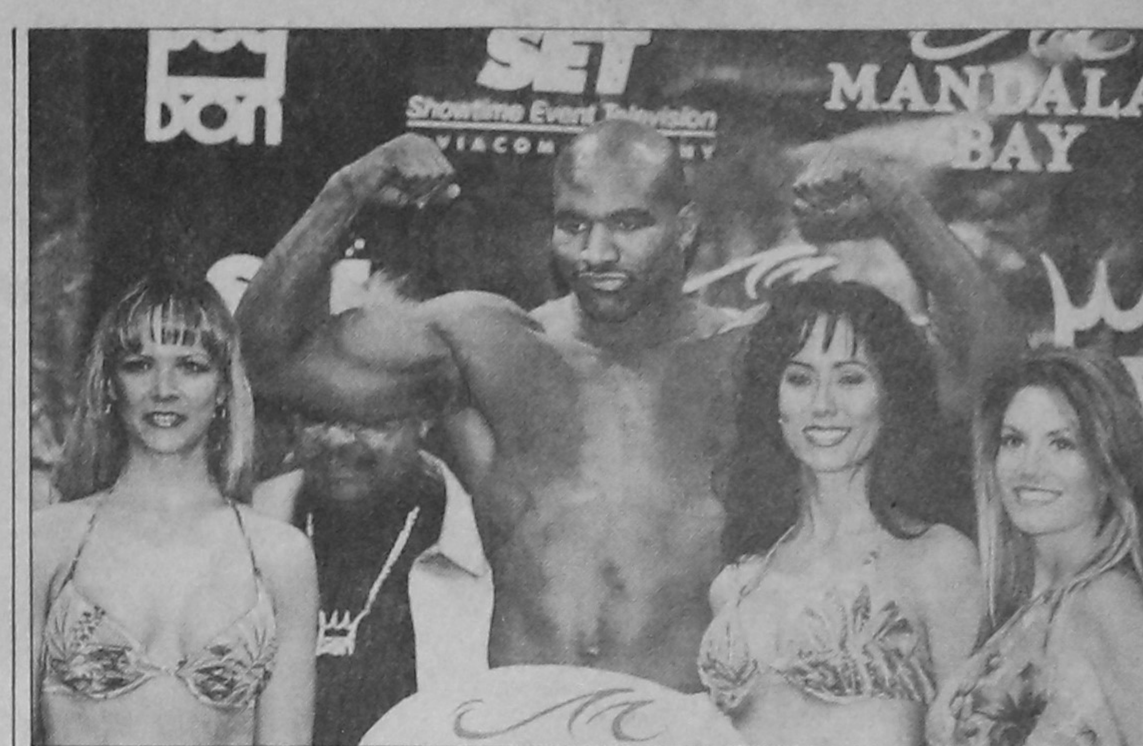
American heavyweight boxer Evander Holyfield shows off his muscles during a weigh-in ahead his bout against compatriot John Ruiz in Las Vegas on March 1.

The Asian Age also had a graphic headlined "duckometer," with details on Bombay all-rounder Ajit Agarkar's seven consecutive ducks against Australia. It nicknamed him the "Bombay duck," in reference to a popular variety of fish.