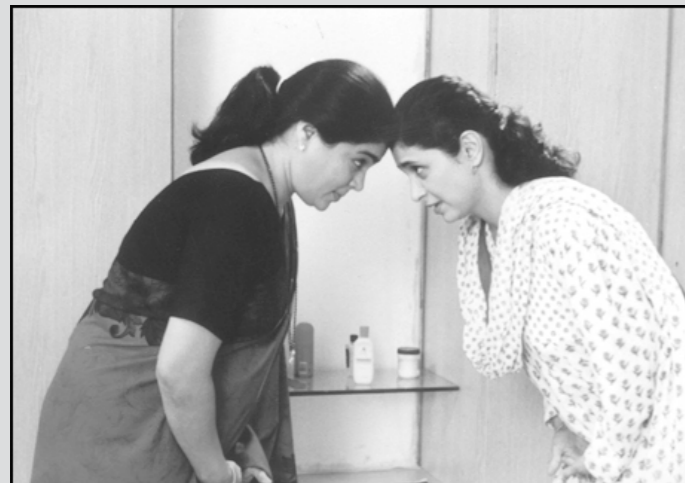
Tu Tu Main Main on Star Plus at 8:30 tonight.