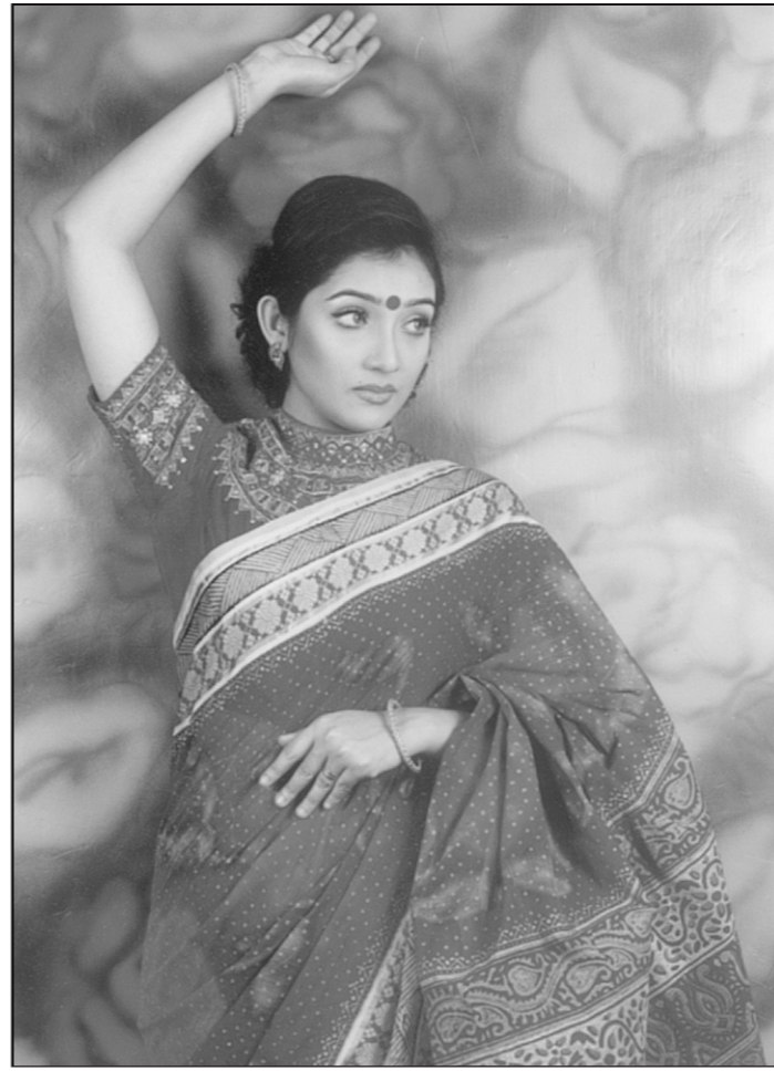
A model displays red block printed saree

The expansion of the work created by boutique houses has come ahead step by step from its scratches without any patronisation from any big houses or institutions at all, the artist says. If more workshops by leading designers from the region were held regularly, the standard of the local designers would improve further, he feels.