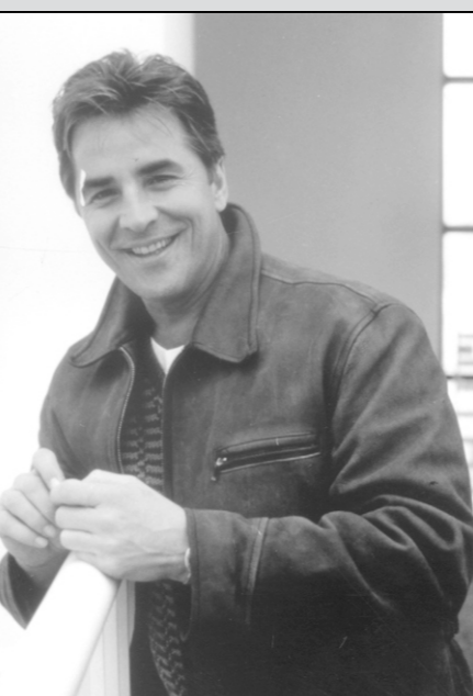
Nash Bridges on Star World at 7:00 & 10:00 p.m.