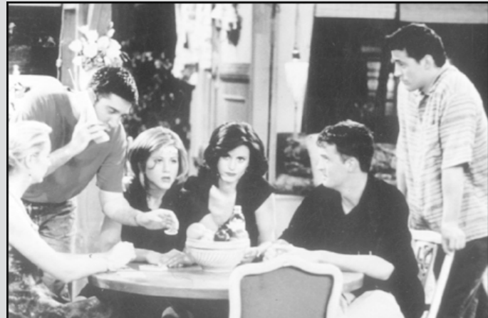
Friends on Star World at 5:00 & 9:00 p.m.