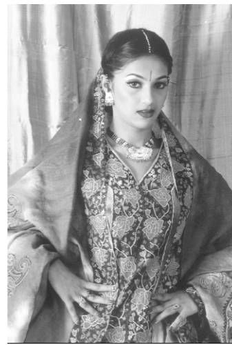
A chic black salwar kameez set