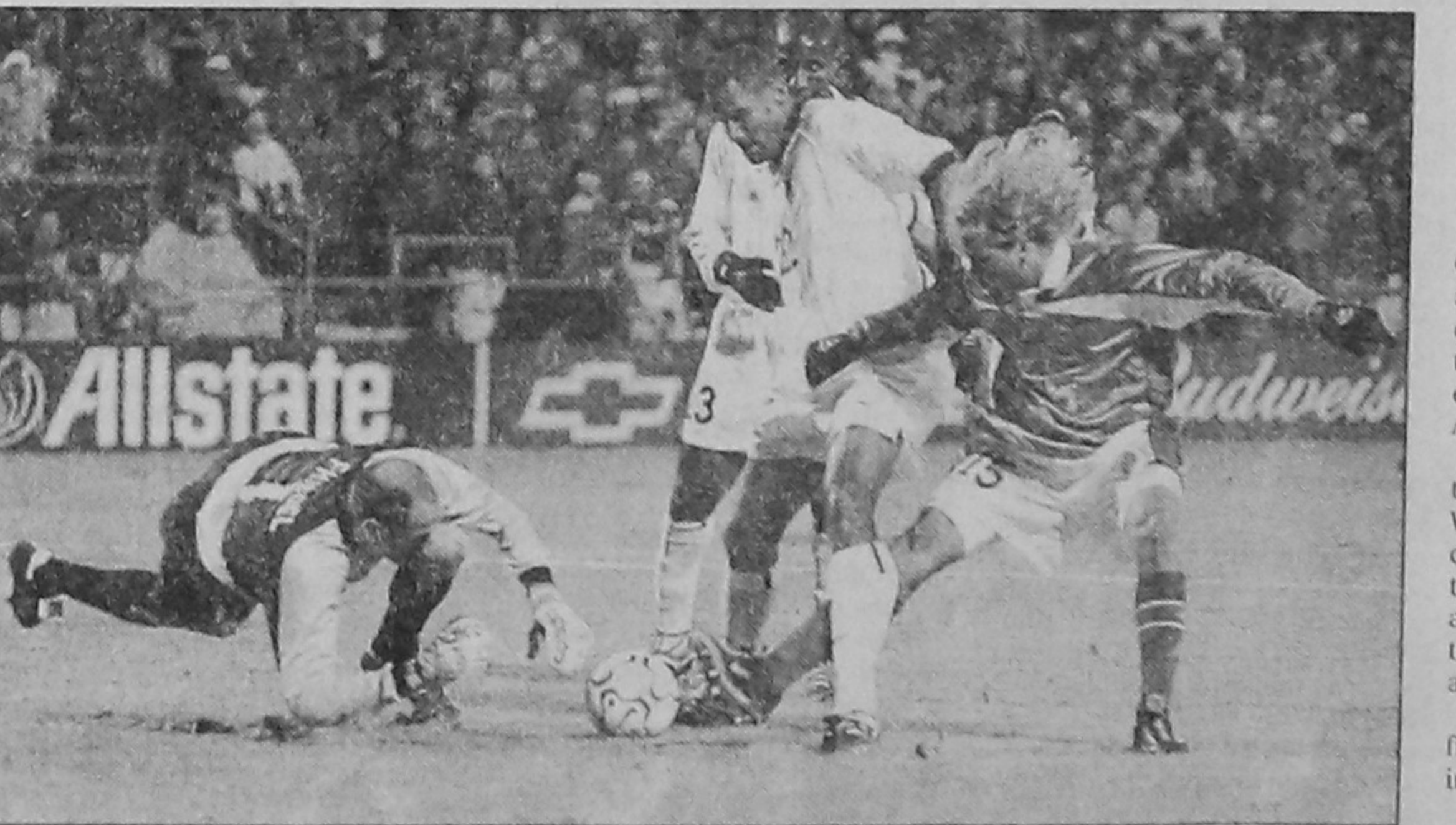
USA defender Tony Sanneh (C) holds off Mexico dangerman Luis Hernandez (R) while custodian Brad Friedel scampers for the ball during their World Cup 2002 CONCACAF Zone qualifier at Columbus on February 28

In the next round of games, Costa Rica next hosts Trinidad and Tobago on March 28 while Honduras takes on the United States. Mexico will host Jamaica on March 25.