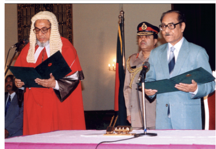
President Shahabuddin Ahmed (right) administers the oath of office of Chief Justice Mahmudul Amin Chowdhury (left) at the Bangabhaban yesterday.