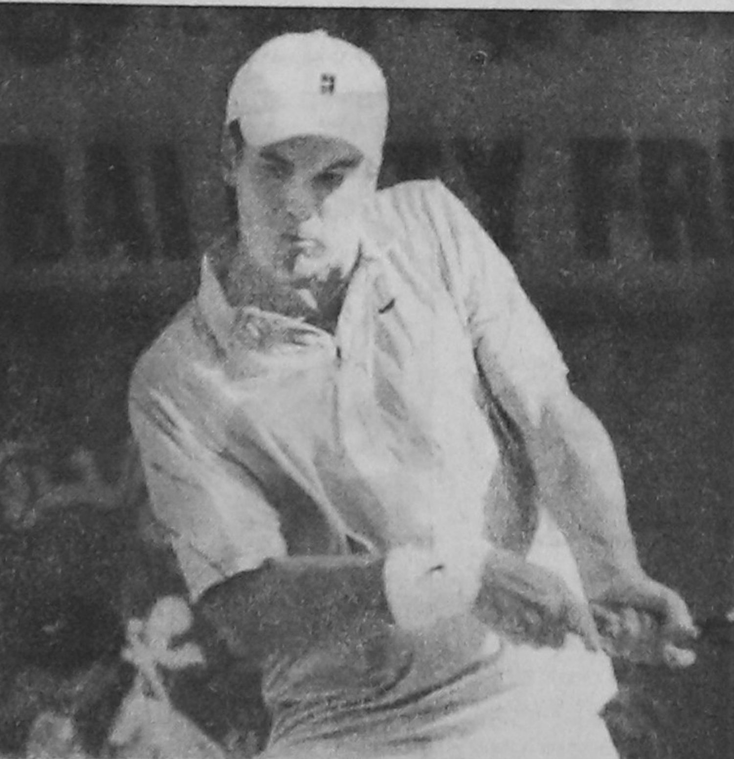
Magnus Norman of Sweden makes a backhand return against Jeff Tarango of the United States during their first round match of the Dubai Open on February 26. Norman won 6-4, 6-4.

CRYPTOQUIP Z M W W H A M X J M F I J O Z T J R Z N Q T M W U J U T I R F I M X R A O U I F O Q U T I H F A N J J I J Yesterday's Cryptquip: I SUPPOSE A PART-TIME BANDLEADER COULD BE CALLED A SEMICONDUCTOR. Today's Cryptquip Clue: J equals S The Cryptquip is a substitution cipher in which one letter stands for another. If you think that X equals O, it will equal O throughout the puzzle. Single letters, short words and words using an apostrophe give you clues to locating vowels. Solution is by trial and error.