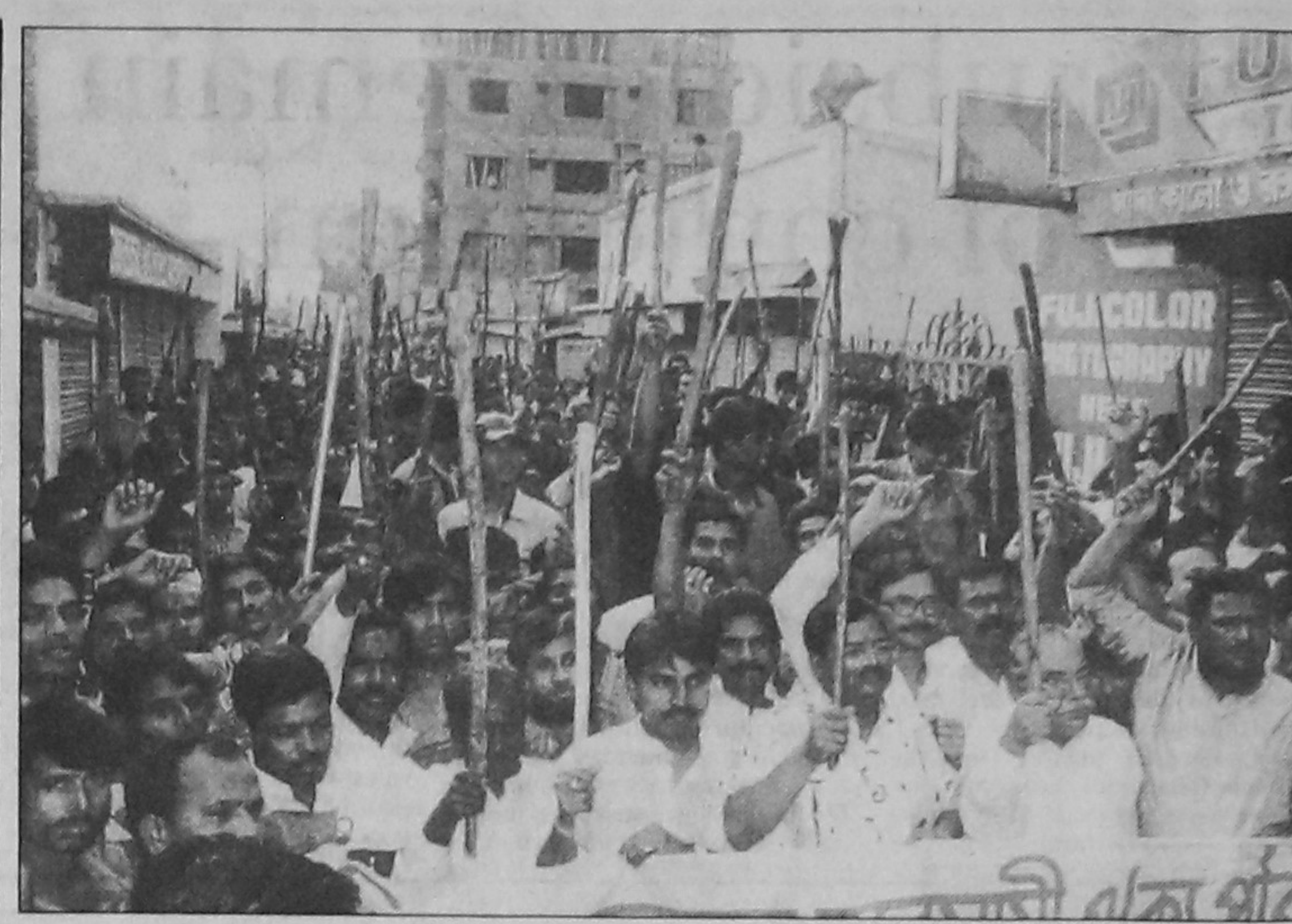
Traders of west Kafrul area in the city brought out a stick procession in the city yesterday protesting extortion and terrorism in their area.